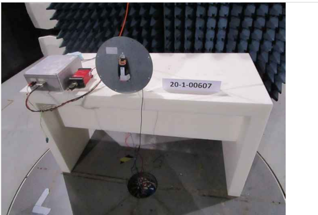
Photograph 4: EUT Setup Magnetic Field Measurements in the Semi anechoic chamber