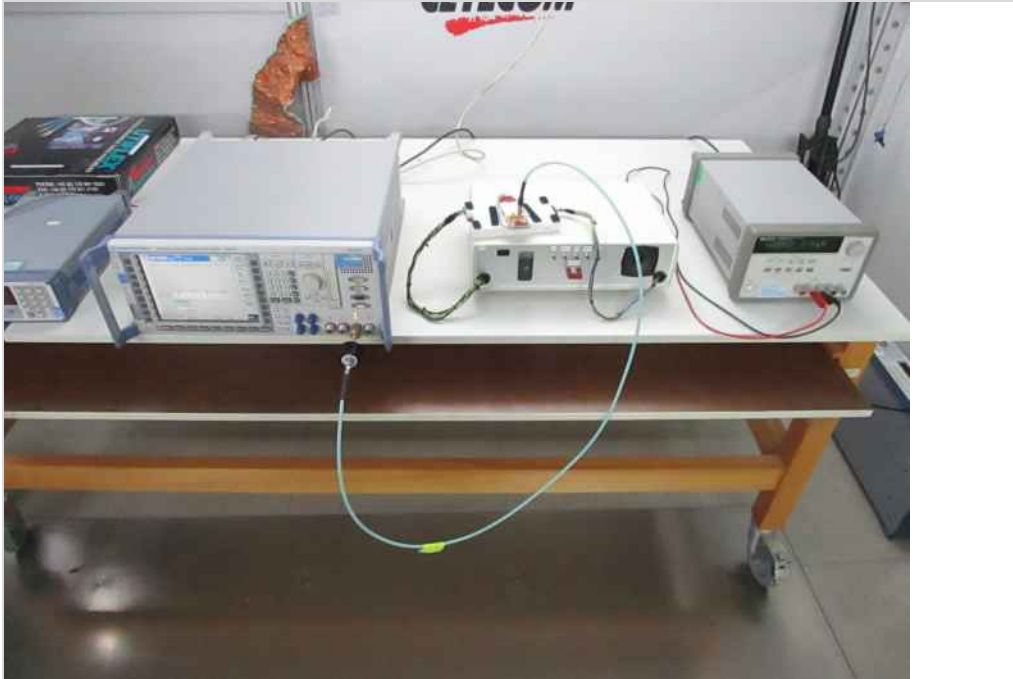
Photograph 5: EUT Setup Conducted RF power