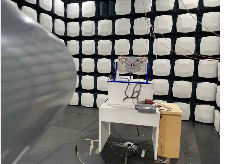
Photograph 1: EUT Test Setup in the anechoic chamber, Radiated emissions