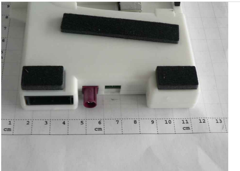
Photograph 4: EUT 1_Right side view