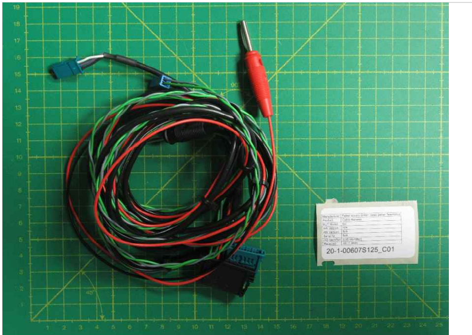
Photograph 6: CAB01