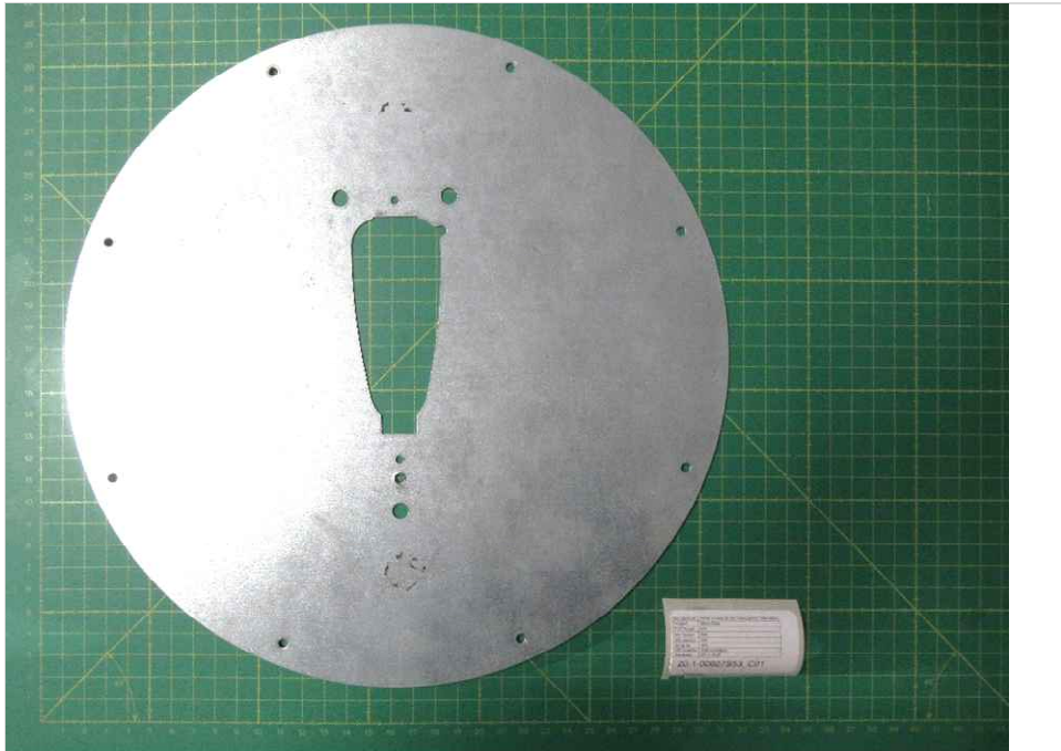
Photograph 1: AE01