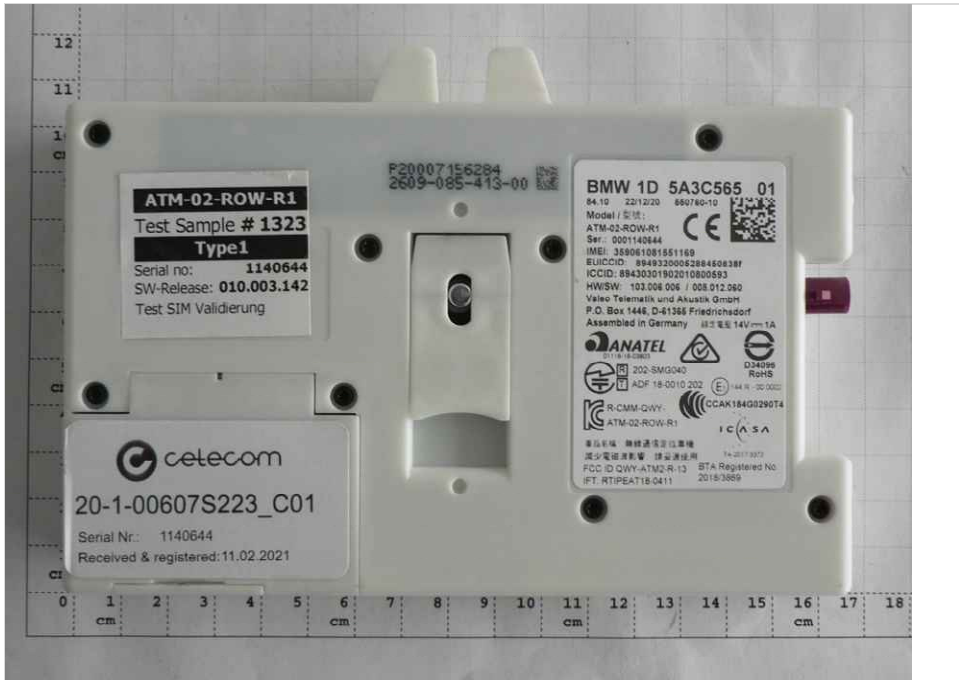
Photograph 1: EUT 1_Top view