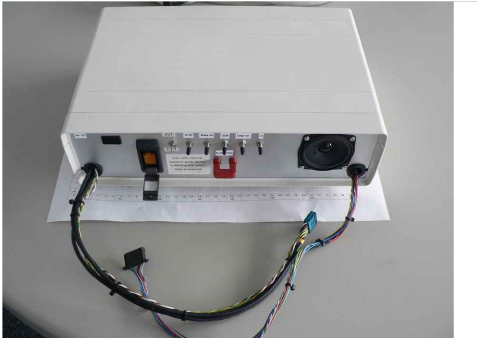
Photograph 3: AE03