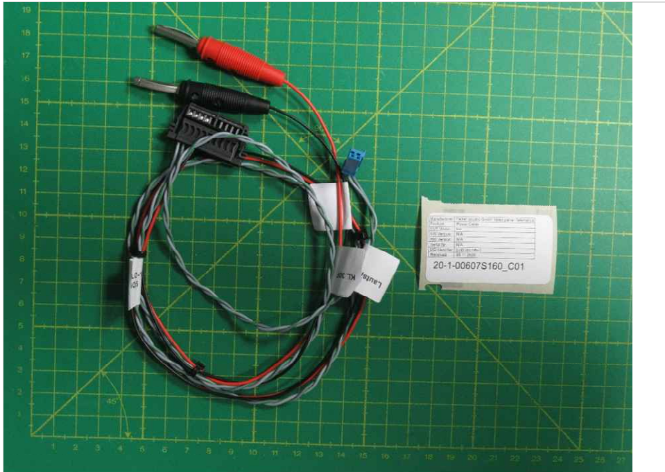
Photograph 5: CAB02