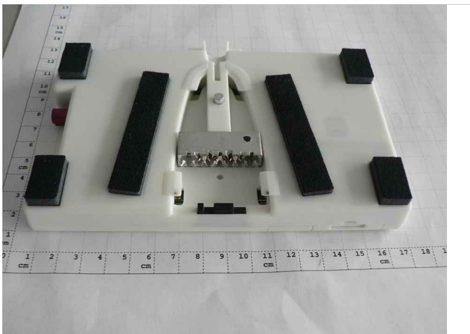
Photograph 2: EUT 1_Rear side view