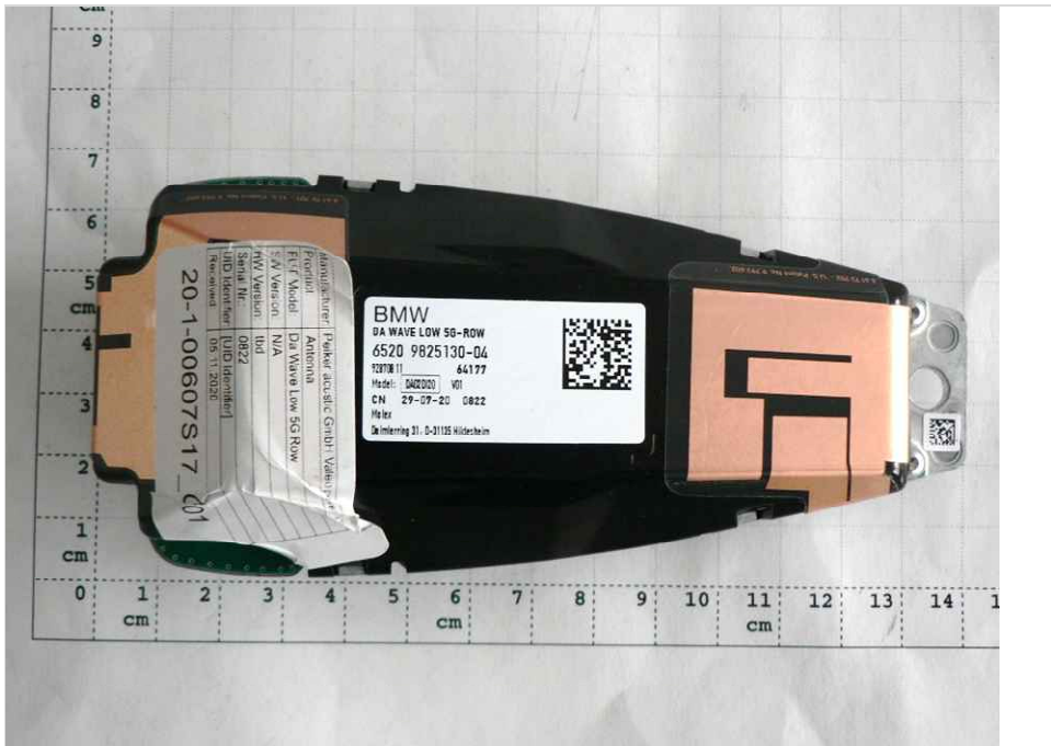
Photograph 5: EUT 02_top view