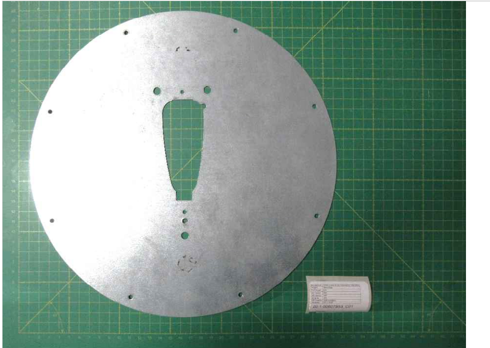
Photograph 1: AE01