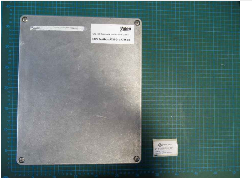
Photograph 5: AE03