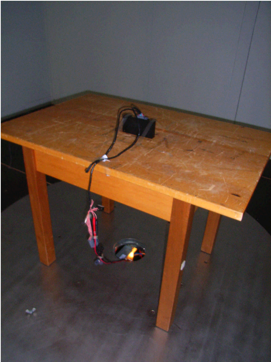
82190_13.jpg EUT, test set-up open area test site

Annex A of test report: F082190E01 EUT: 2BTHFCK2 Manufacturer: Peiker acoustic GmbH