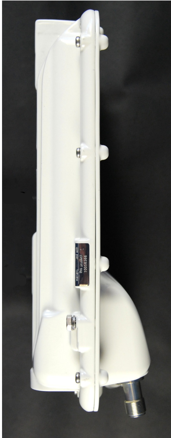
Side View C050067B014A - PTP 670 (4.9 to 5.9 GHz) ATEX/HAZLOC Connectorized ODU (FCC)

PTP 670 FCC ID: QWP-50670EX, ATEX/HAZLOC variant of the PTP 670. Label Position highlighted in RED