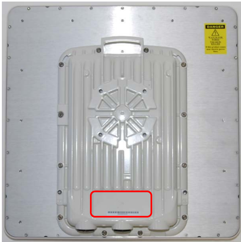
Rear View C050067B013A - PTP 670 (4.9 to 5.9 GHz) ATEX/HAZLOC Integrated 23 dBi ODU (FCC)