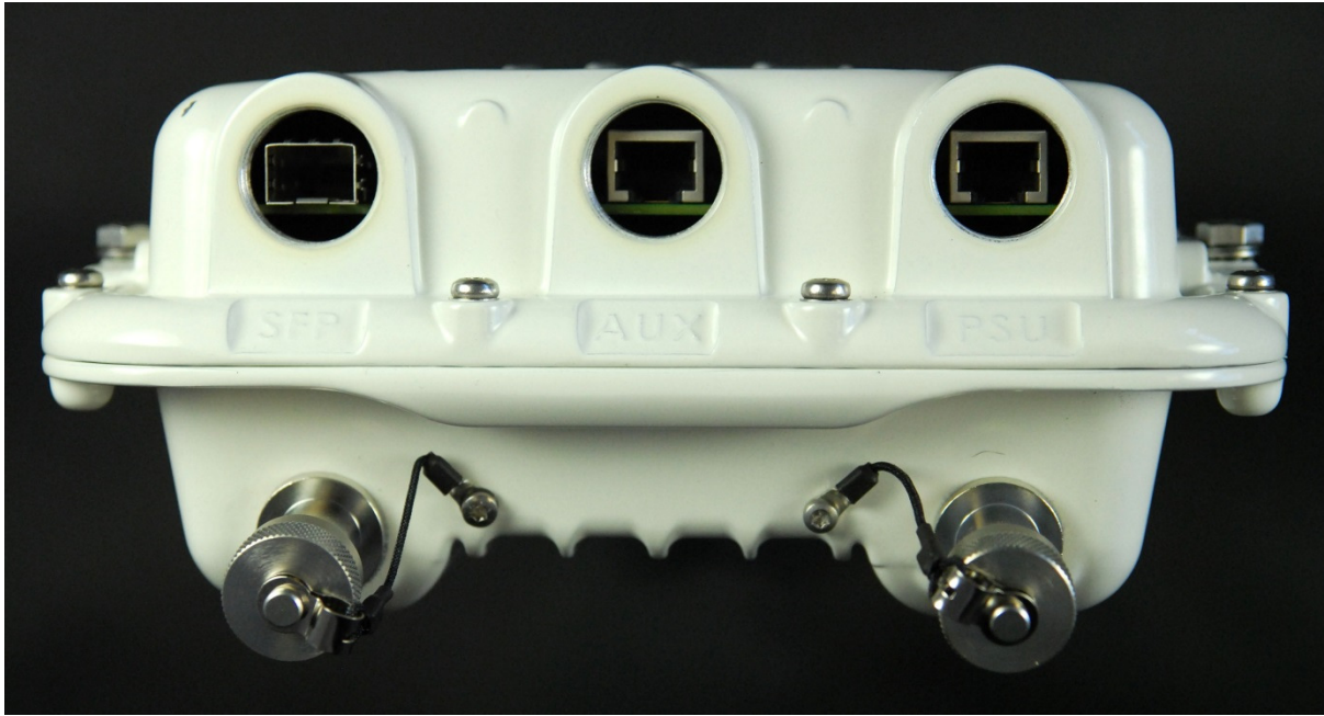
Bottom View C050067B014A - PTP 670 (4.9 to 5.9 GHz) ATEX/HAZLOC Connectorized ODU (FCC)

PTP 670 FCC ID: QWP-50670EX, ATEX/HAZLOC variant of the PTP 670. Label Position highlighted in RED