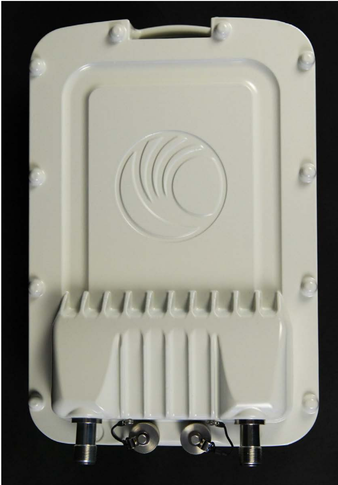
Front View C050067B014A - PTP 670 (4.9 to 5.9 GHz) ATEX/HAZLOC Connectorized ODU (FCC)