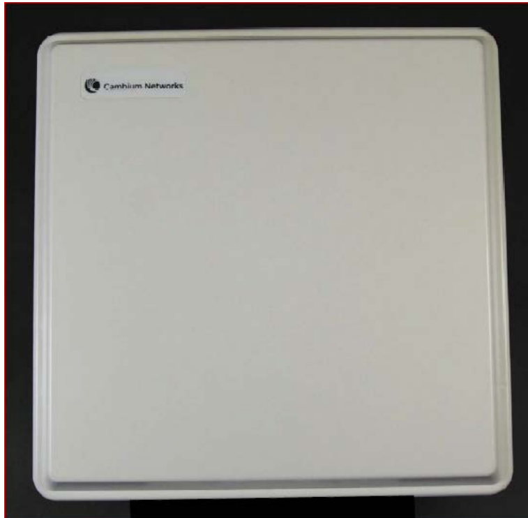
Front View C050067B013A - PTP 670 (4.9 to 5.9 GHz) ATEX/HAZLOC Integrated 23 dBi ODU (FCC)

PTP 670 FCC ID: QWP-50670EX, ATEX/HAZLOC variant of the PTP 670. Label Position highlighted in RED