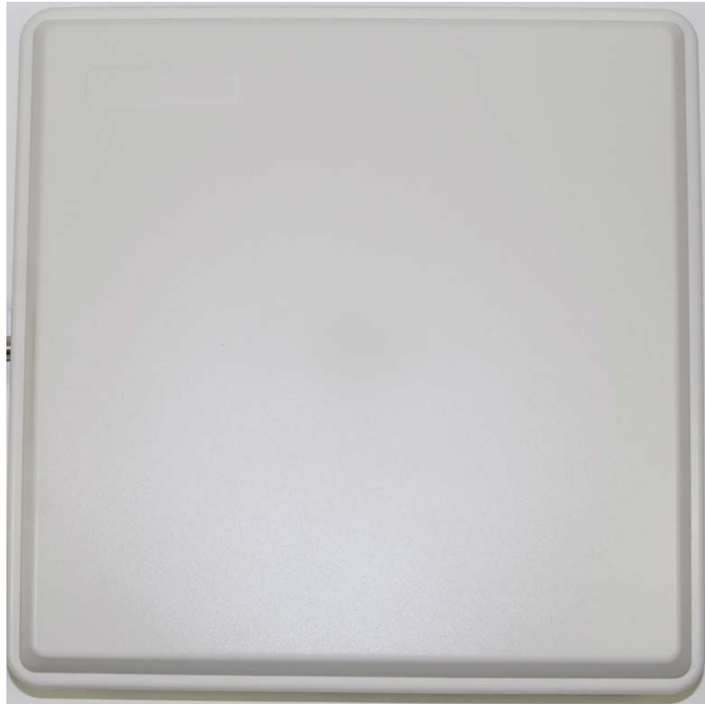
Front View C050067B001A - PTP 670 (4.9 to 6.05 GHz) Integrated 23 dBi ODU (FCC)

PTP 670 FCC ID: QWP-50670: External Pictures, Label Position Highlighted in RED