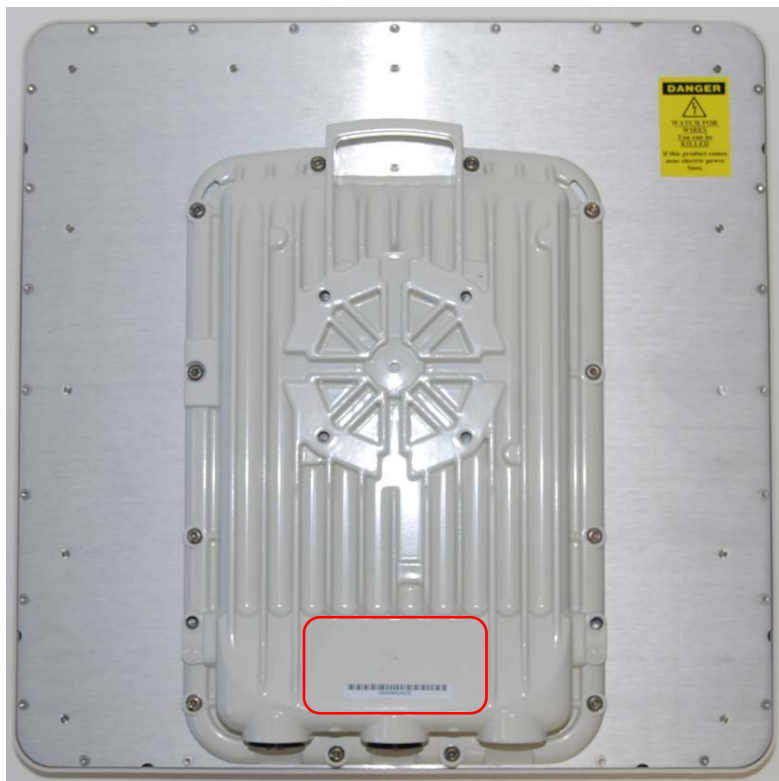
Rear View C050067B001A - PTP 670 (4.9 to 6.05 GHz) Integrated 23 dBi ODU (FCC)