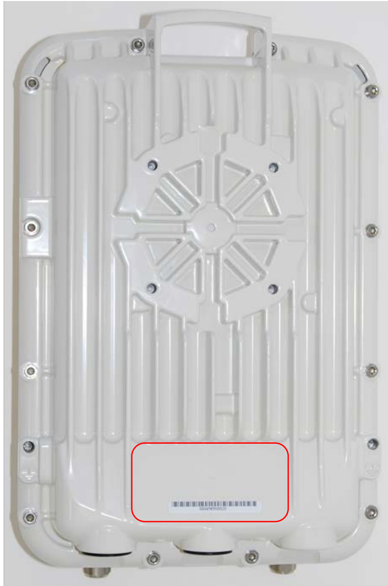
Rear View C050067B003A - PTP 670 (4.9 to 6.05 GHz) Connectorized ODU (FCC)