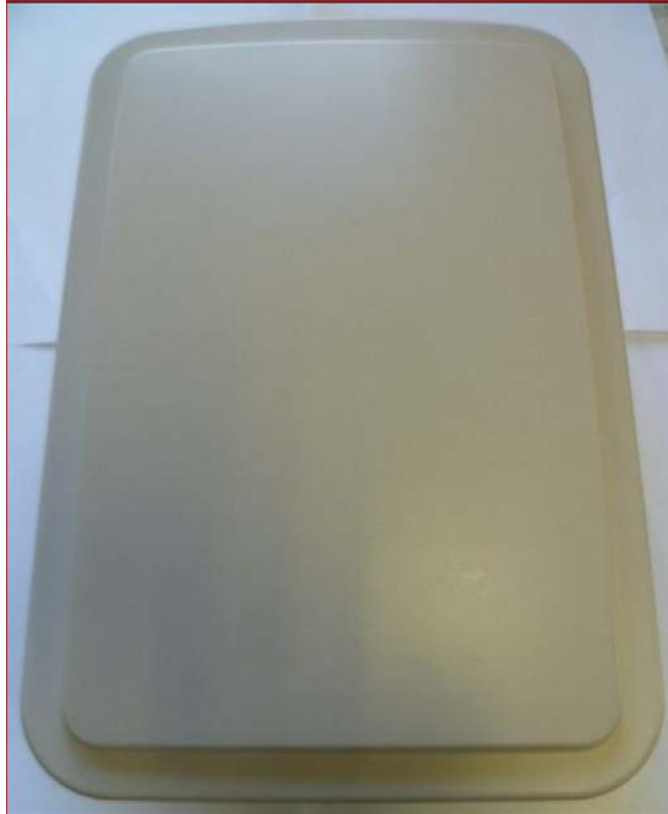
Front View C050067B002A - PTP 670 (4.9 to 6.05 GHz) Integrated 19 dBi ODU (FCC)

PTP 670 FCC ID: QWP-50670: External Pictures, Label Position Highlighted in RED