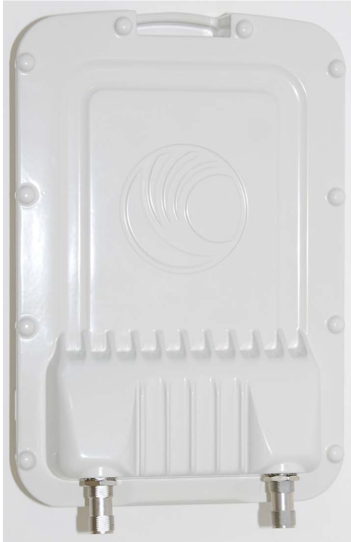
Front View C050067B003A - PTP 670 (4.9 to 6.05 GHz) Connectorized ODU (FCC)