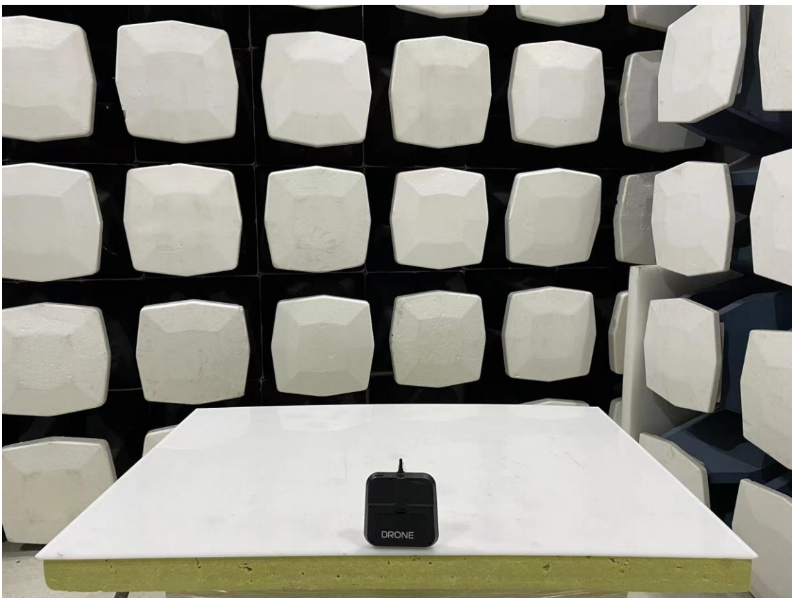
Up to 1GHz (The EUT placed at the center of the turntable)