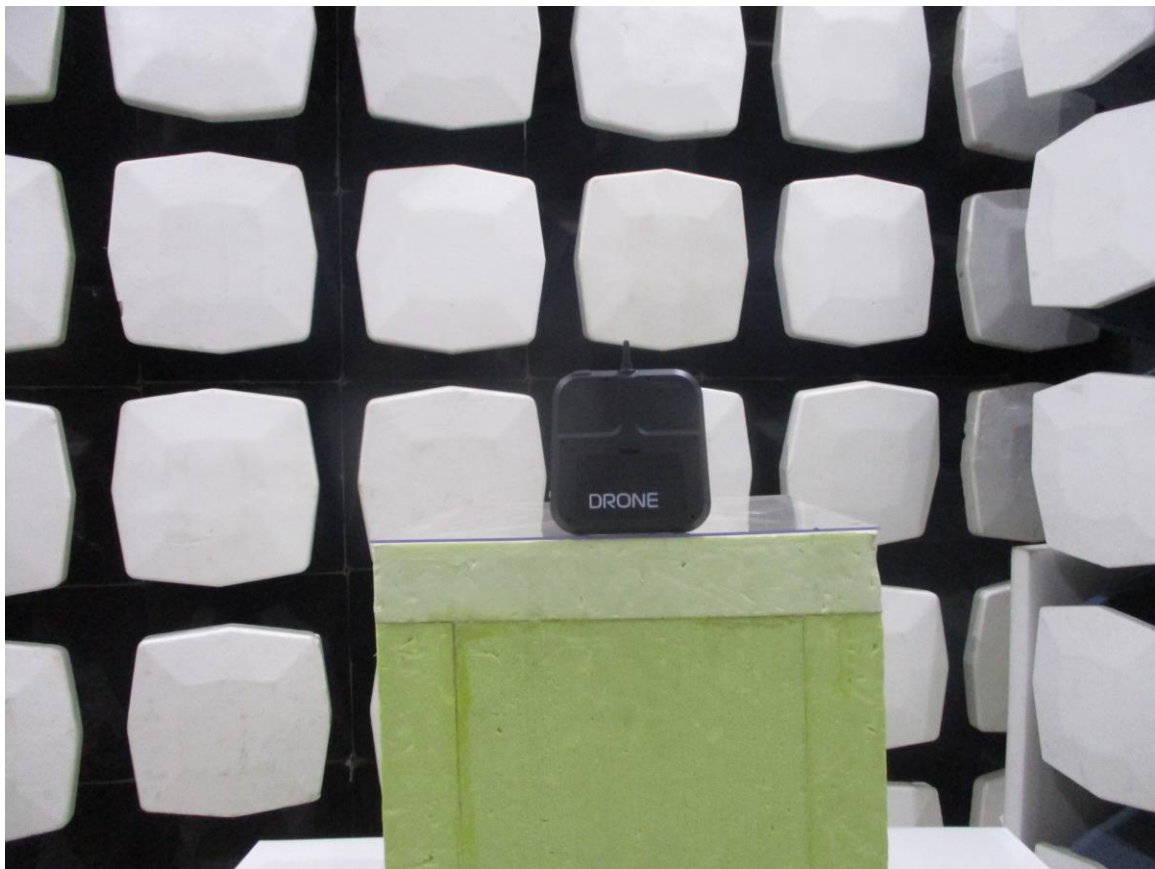
Above 1GHz (The EUT placed at the center of the turntable)