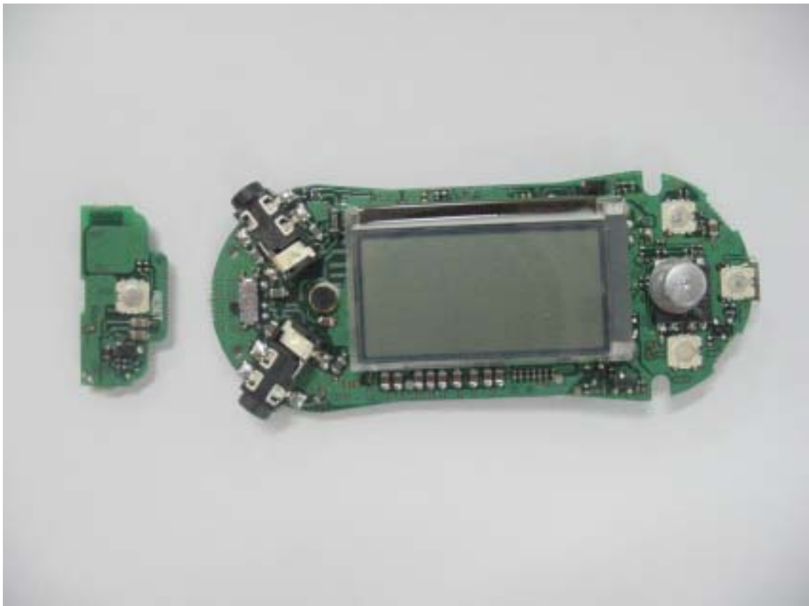
<FRONT SIDE OF MAIN BOARD>