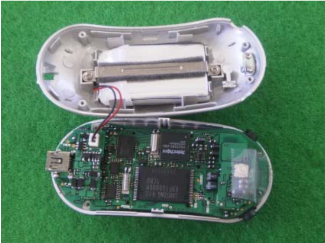
<INNER SIDE OF EUT>