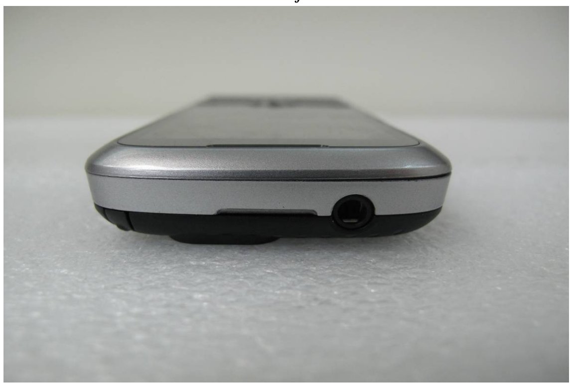
Side View of EUT-3