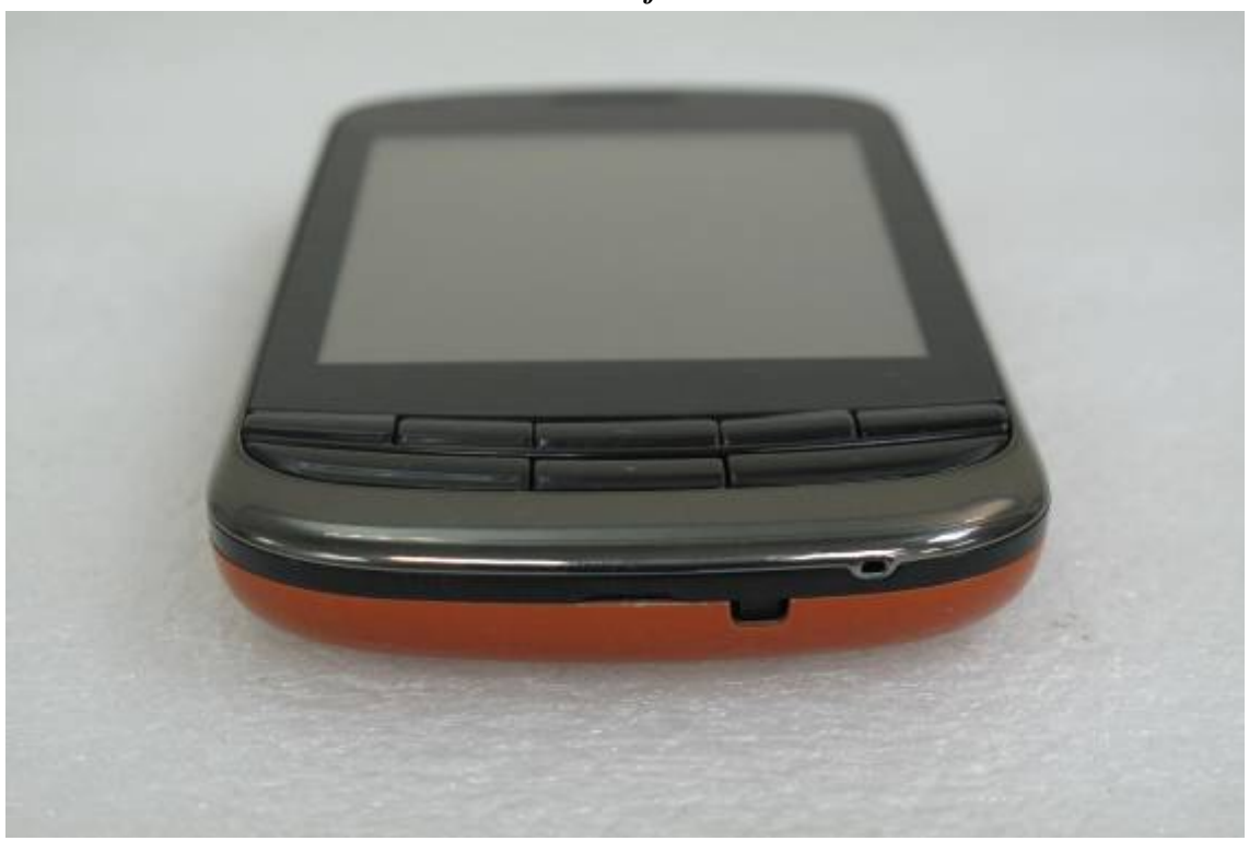
Side View of EUT-2