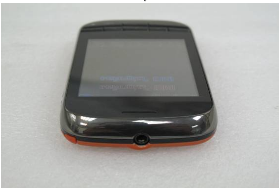
Side View of EUT-4