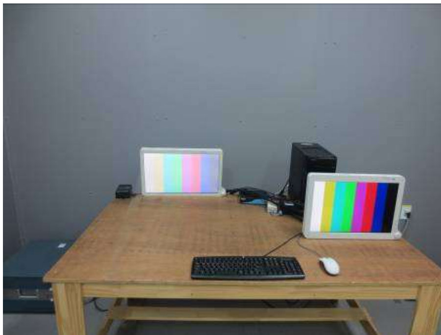
Figure 1. Conducted Emission Test Setup : SDI Mode