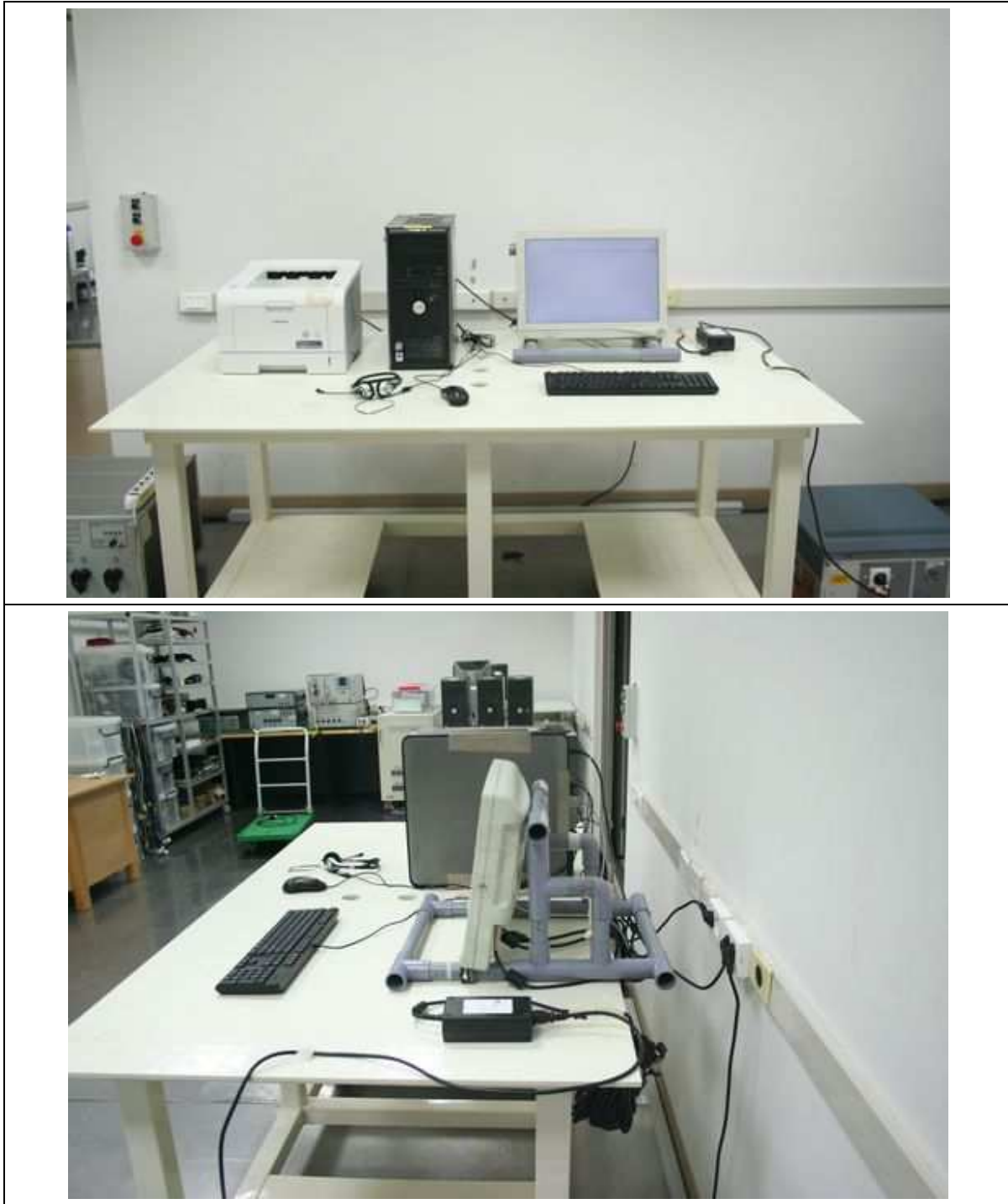
Figure 1. Conducted Emission Test Setup for DVI Mode: