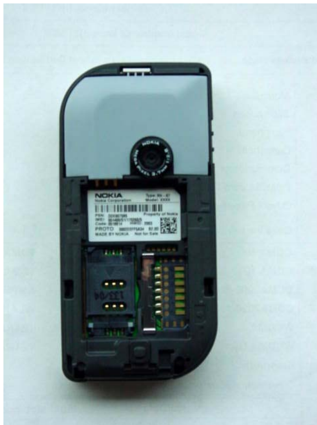
Photograph 1 – Label location