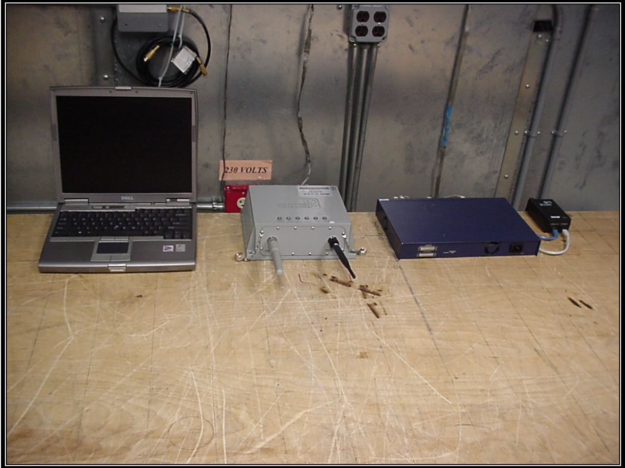
Photograph 4: Conducted Testing Front View