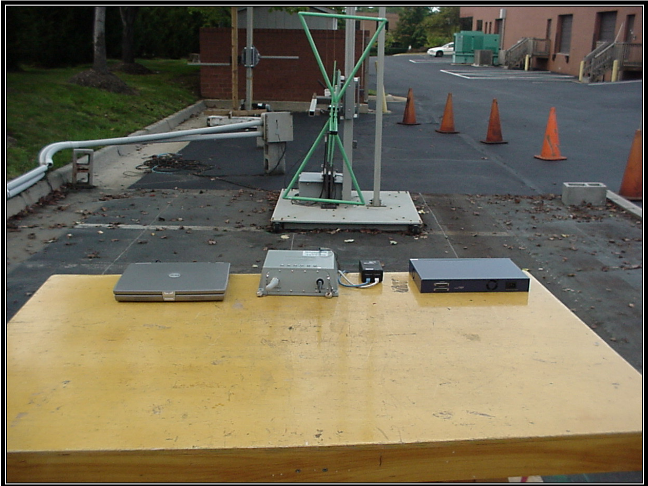
Photograph 2: Radiated Testing Front View