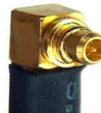
MMCX to N-Male Pigtail 60"