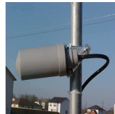
9 dBi Linear Feed Antenna N Female with dish options