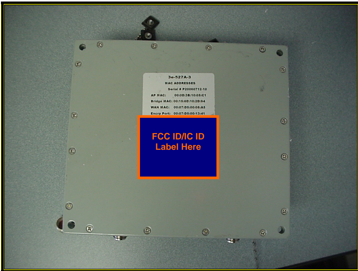
Photograph 1: FCC ID/IC ID Label Location

Please refer to the following page for a sample of the FCC/IC Identification Label.