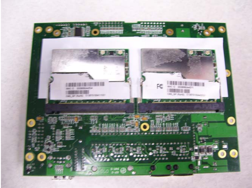
Figure 3 - Evaluation Board, Bottom