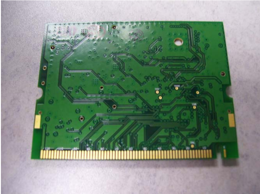
Figure 2 - PCI Module, Bottom