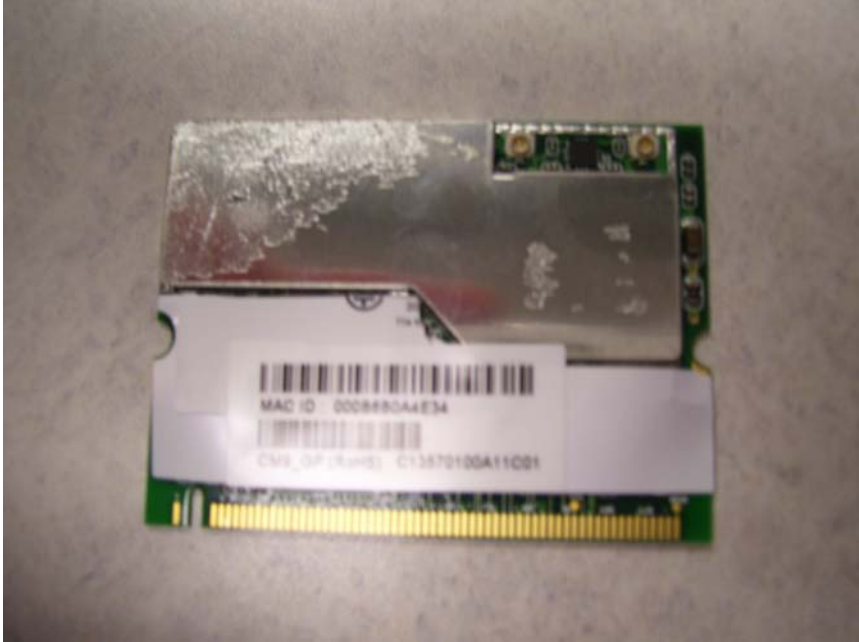
Figure 1 - PCI Module, Top