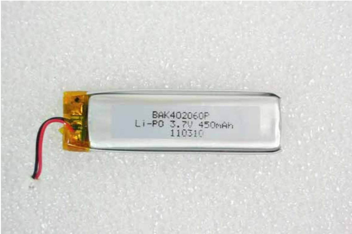
Open View of EUT-1