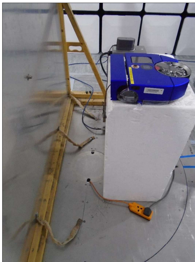
Figure 362 - Test Setup - AC Line Conducted Emissions