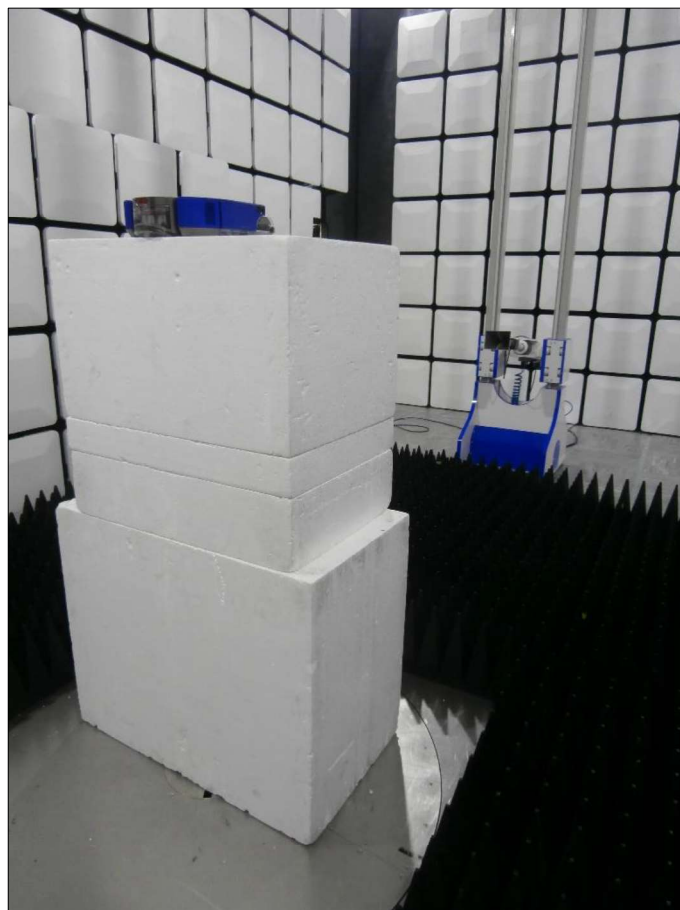
Figure 365 - Test Setup - 1 GHz to 18 GHz