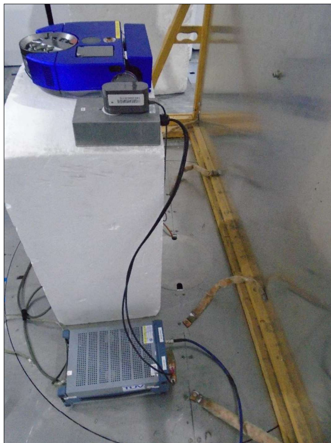
Figure 363 - Test Setup - AC Line Conducted Emissions