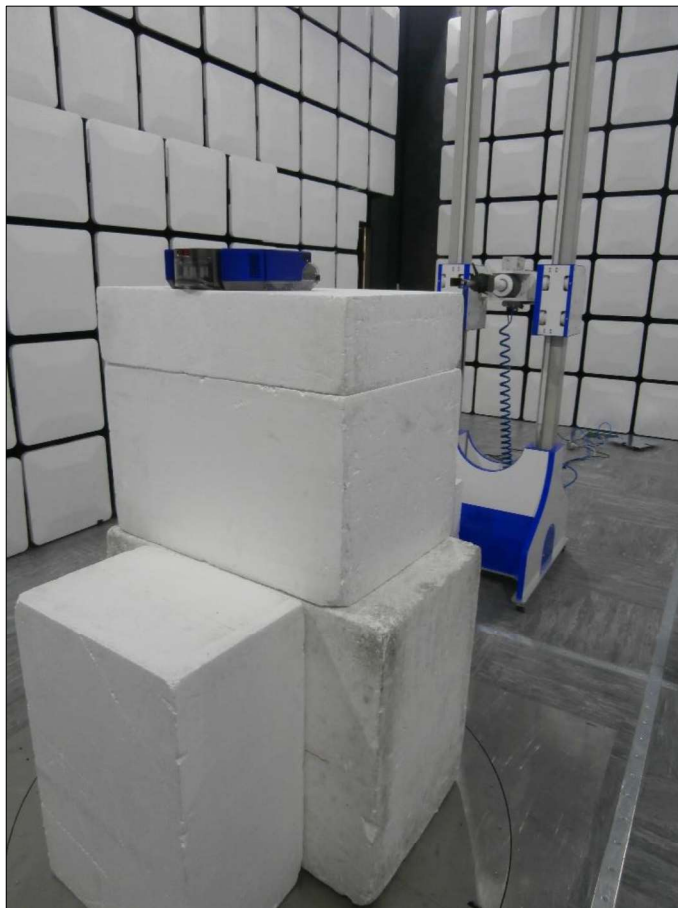
Figure 366 - Test Setup - 18 GHz to 25 GHz