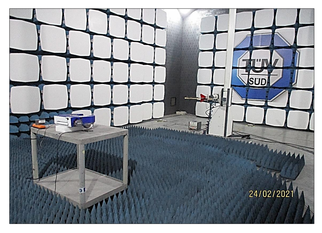
Figure 2 - Test Setup - 1 GHz to 18 GHz