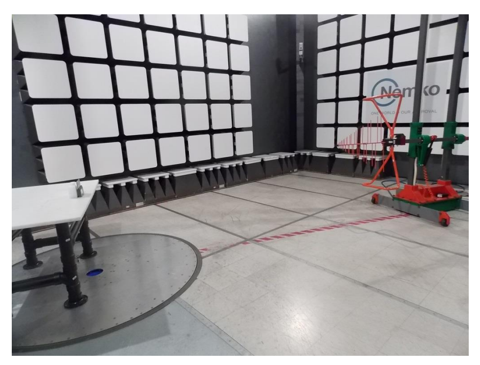
Figure 1-1: Radiated emissions setup photo