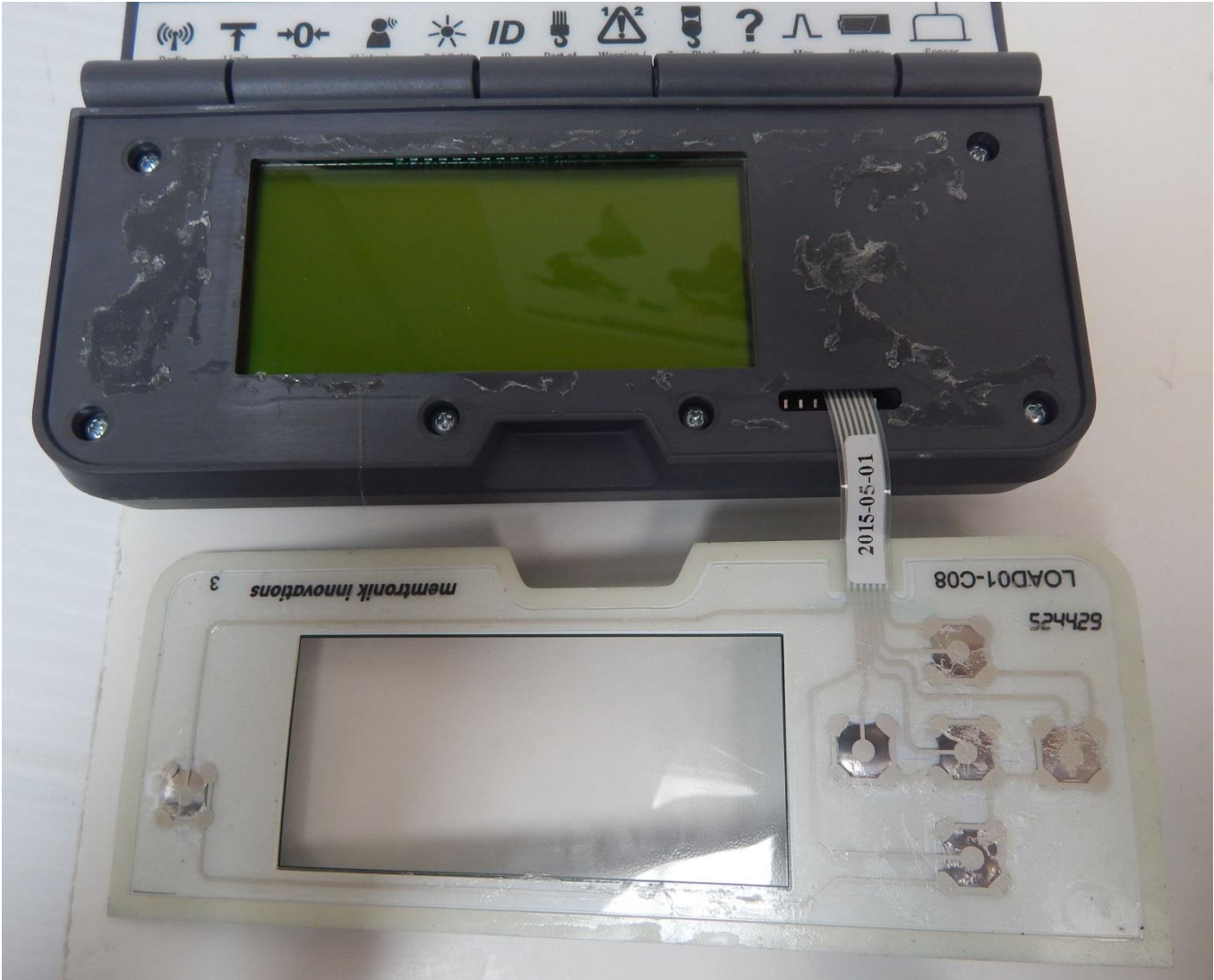
Figure 1-1: Internal view