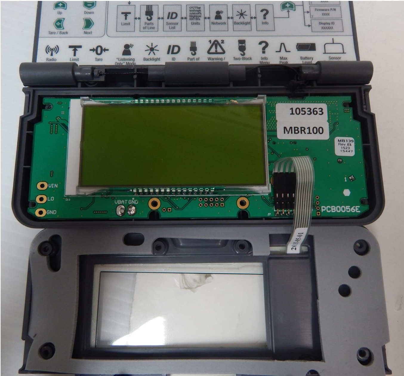
Figure 1-2: Internal view