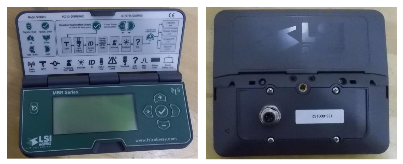
Figure 1-1: Top view (MBR105)