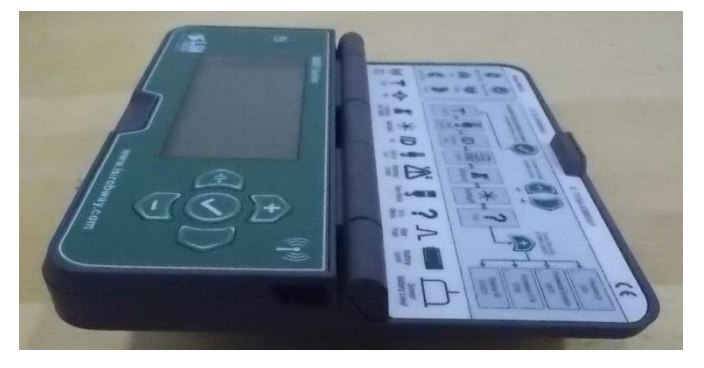
Figure 1-2: Bottom view (MBR105)