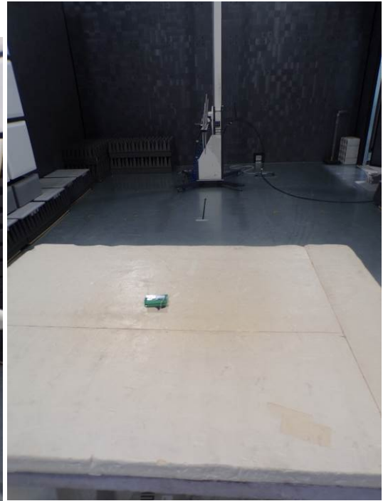
Test setup for frequency below 1GHz