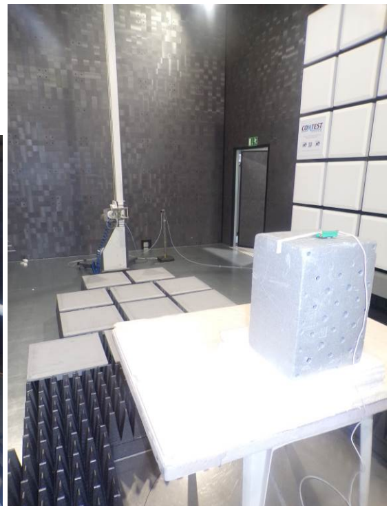
Test setup for frequency above 1GHz