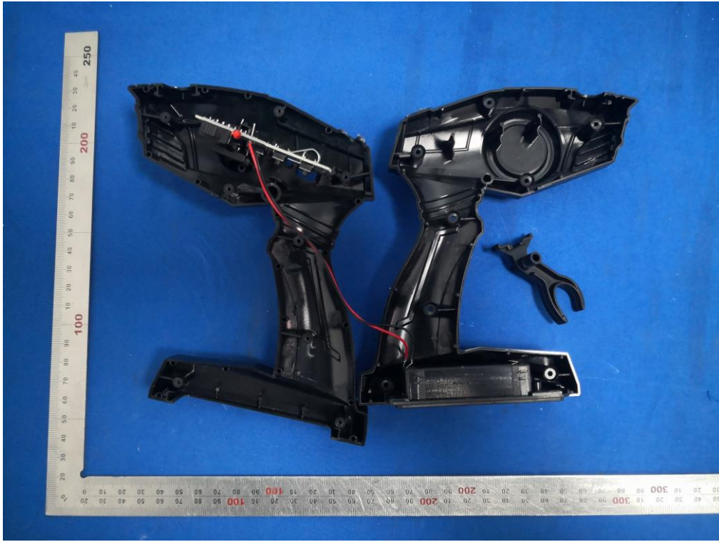
INTERNAL VIEW OF EUT (FIGURE 1)