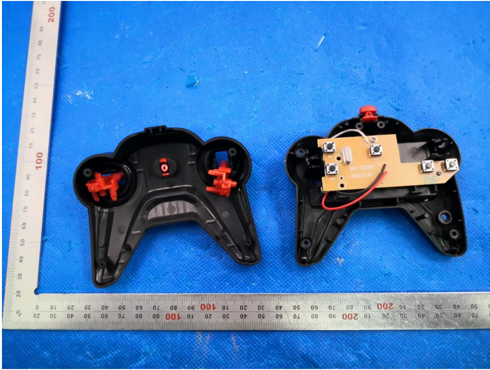
INTERNAL VIEW OF EUT (FIGURE 1)