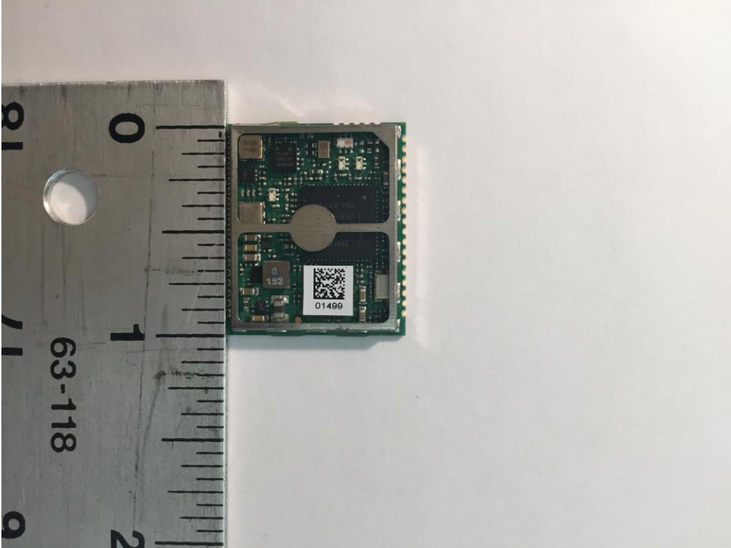
EUT – Width Open view