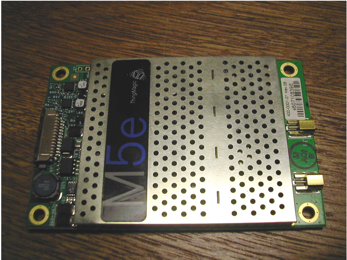
Top (with shield)