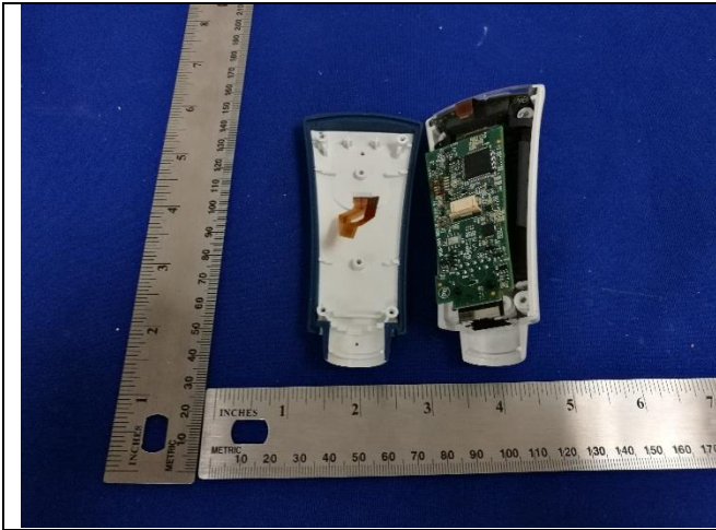
EUT- Open Case View