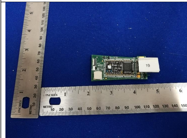
EUT- Bottom View