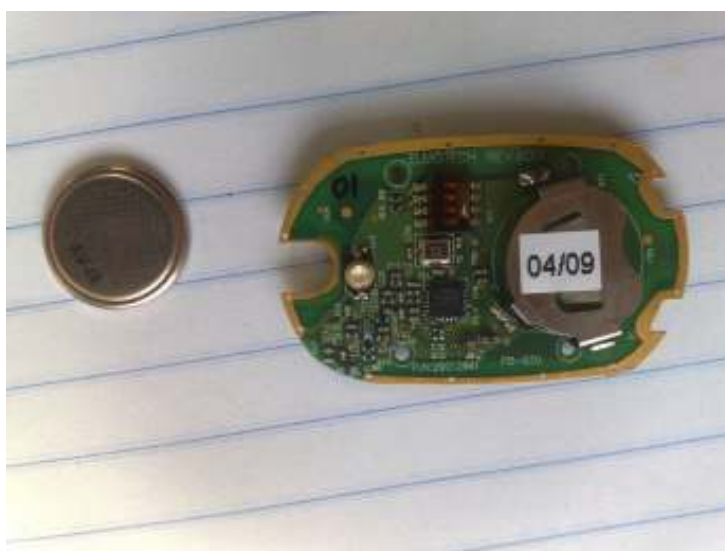
Figure 2: PB-830 PCB (Top)