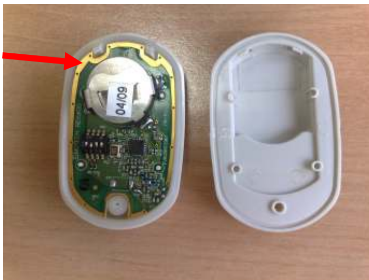
Figure 1: PB-830 (Cover Open)