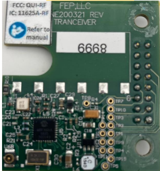
Printed Circuit Board-Top Side