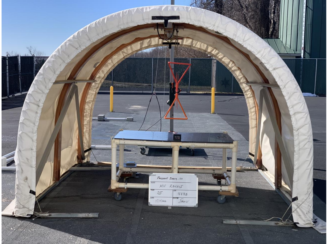
RE Below 1GHz Rear