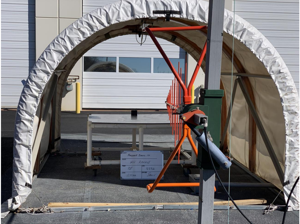
RE Below 1GHz Front