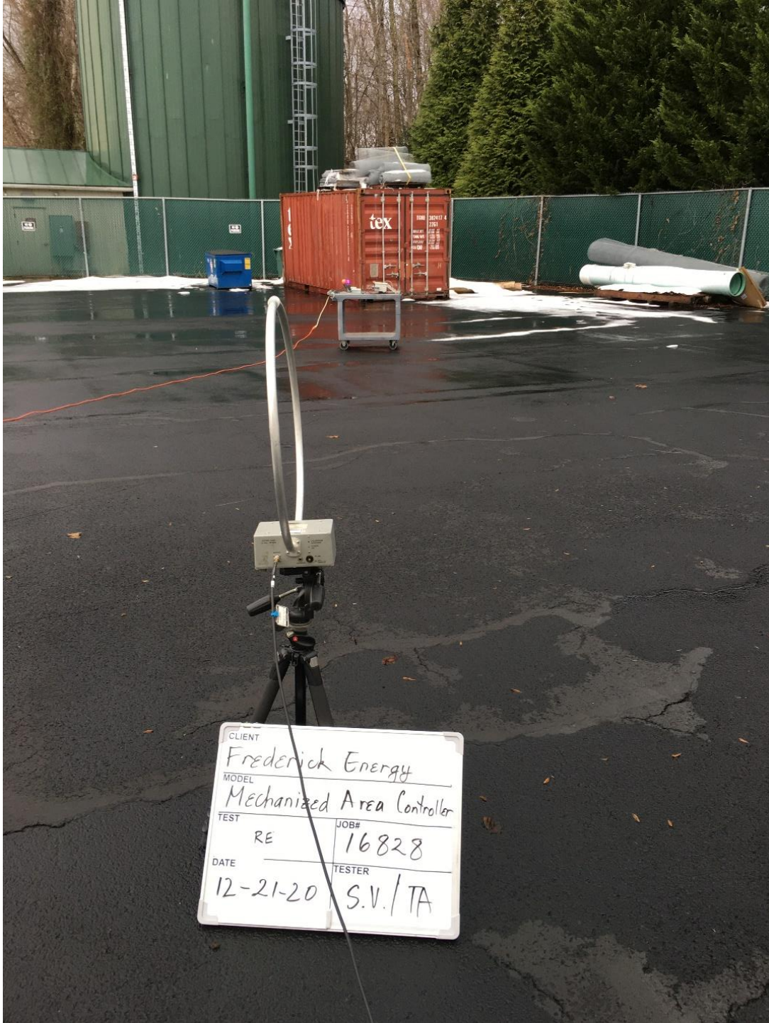
Below 30MHz, 10 meters_RE-2