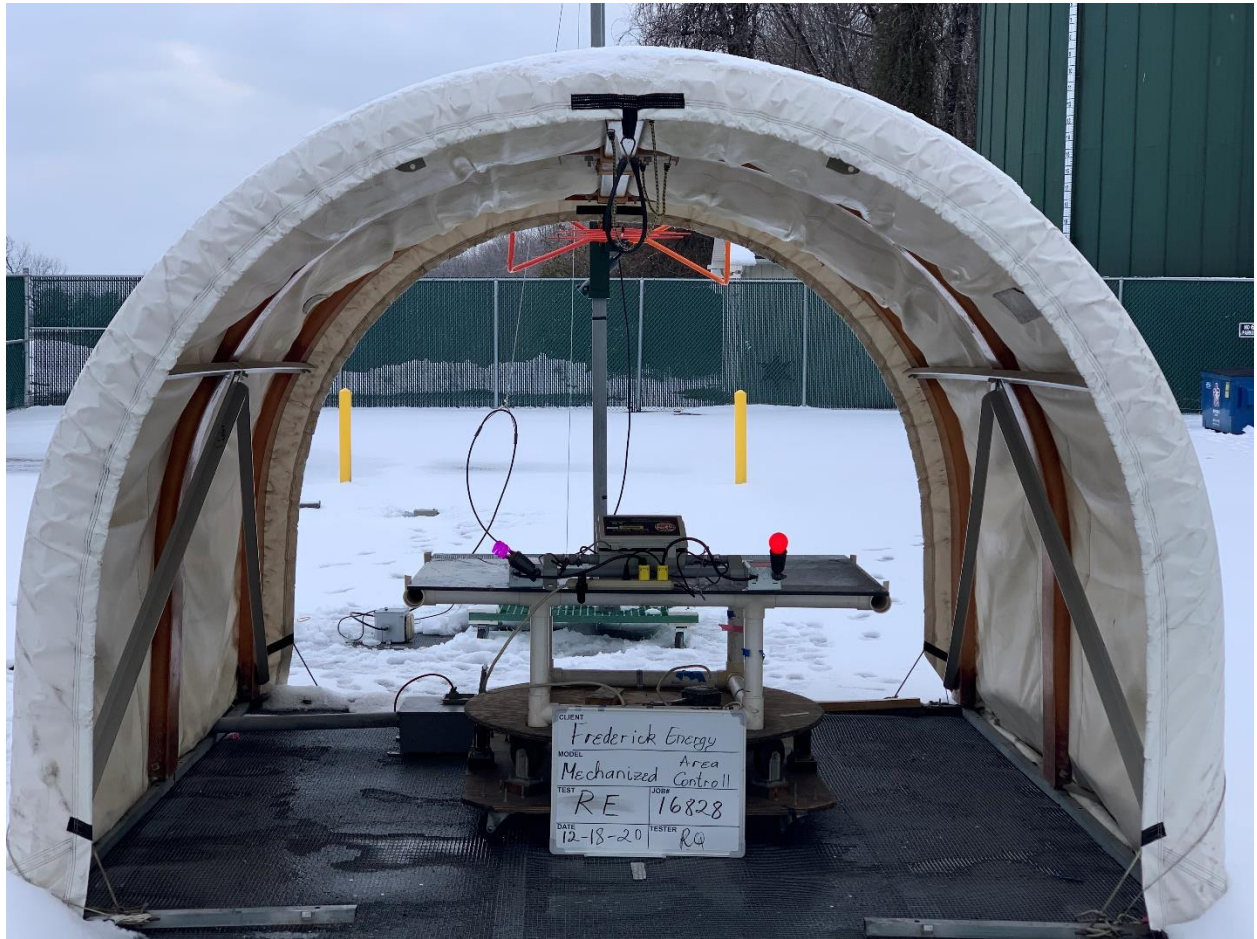
Above 30 MHz - RE REAR