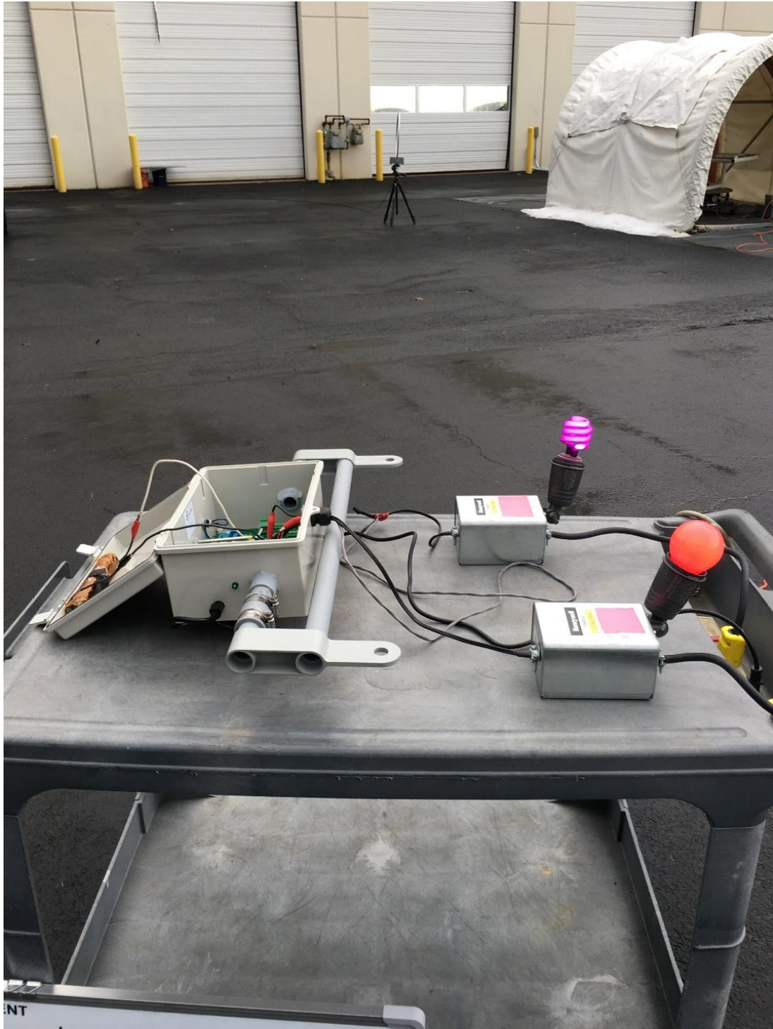
Below 30 MHz, 10 meters_RE-4