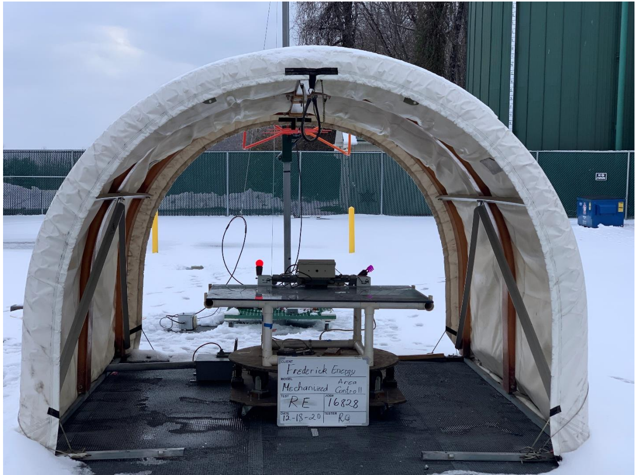
Above 30 MHz - RE Front