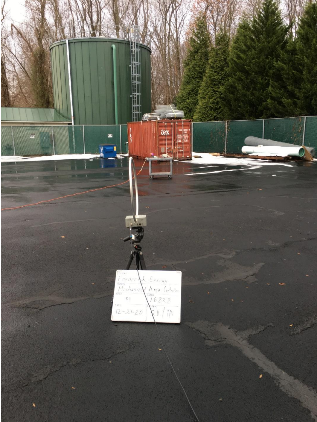
Below 30 MHz, 10 meters_RE-1