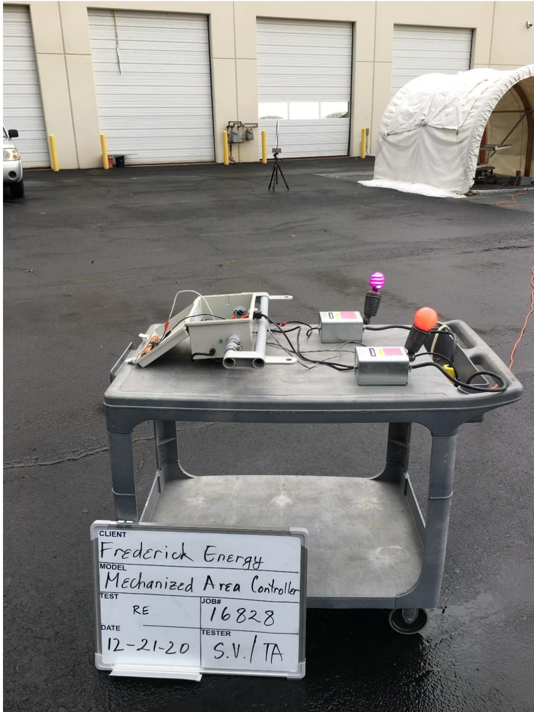
Below 30 MHz, 10 meters_RE-3