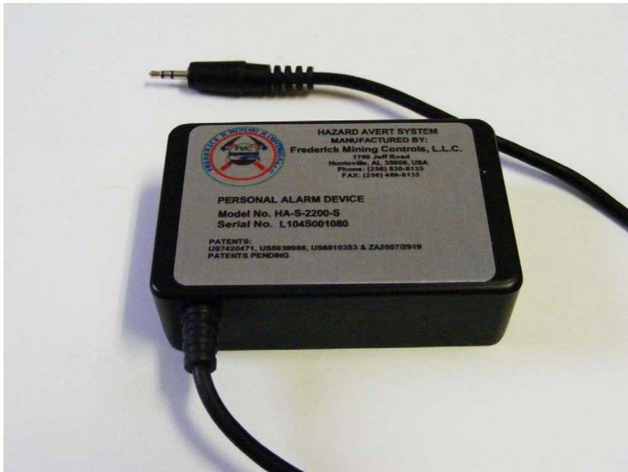
Surface Pad – External Photo Top View