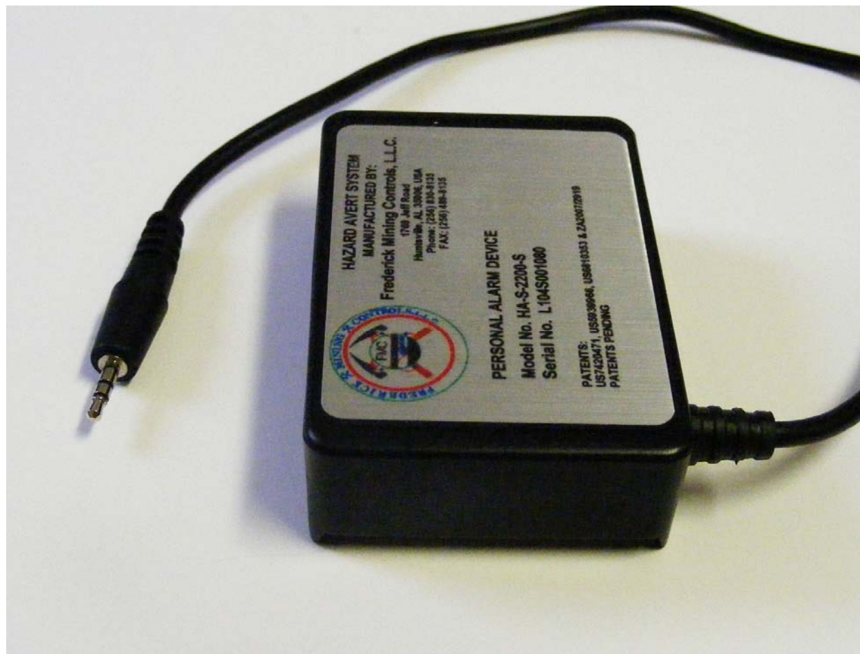
Surface Pad – External Photo End View