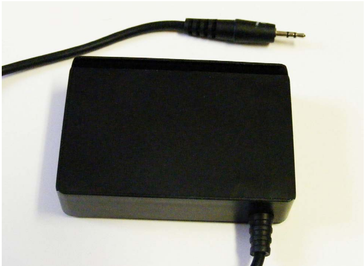
Surface Pad – External Photo Back View