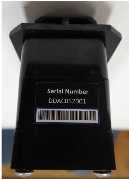
Serial No. Label for Standard MFG (Label 2)