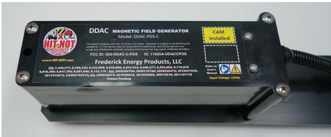
MFG with CAM Label (Label 1)

If equipped with a CAM, the white dotted box in the upper right corner will contain a label stating "CAM Installed". Model number for generator with CAM is DDAC-PDS-C. Model number for generator without CAM is DDAC-PDS