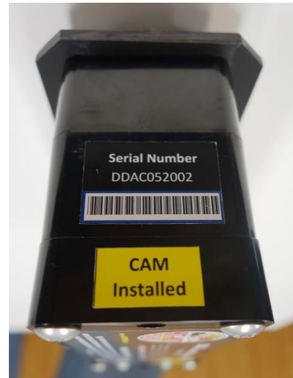
Serial No. Label for MFG with CAM (Label 2)