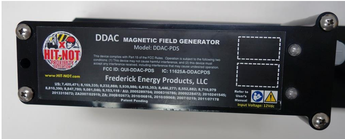
Standard MFG Label (Label 1)