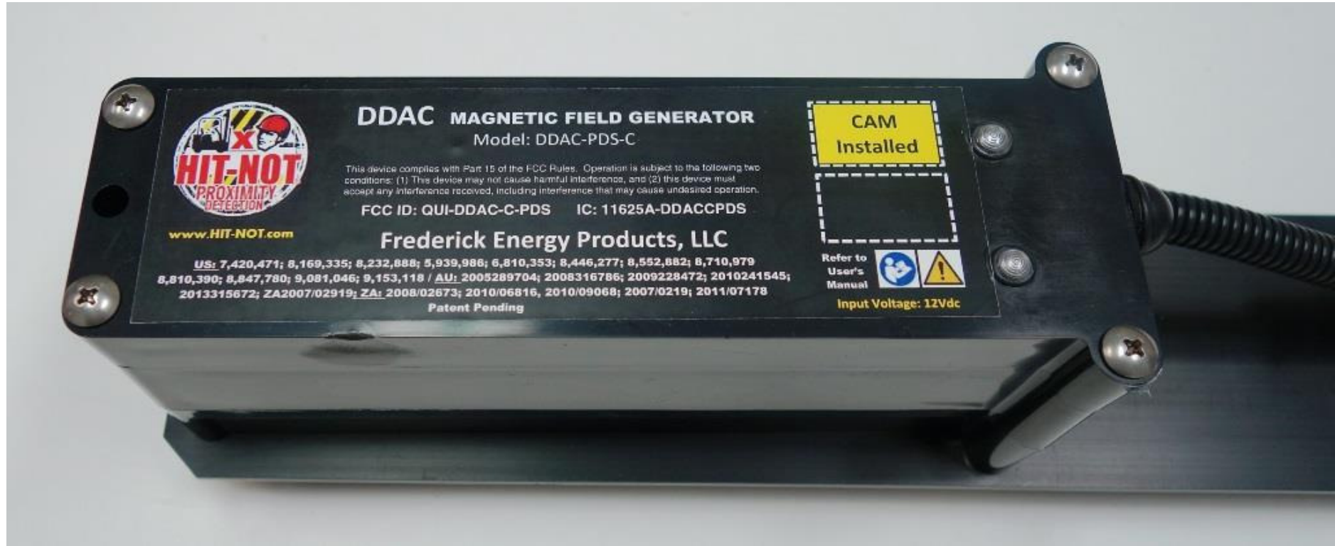
Magnetic Field Generator w/ CAM -External Photo Label Side with Mounting Arm