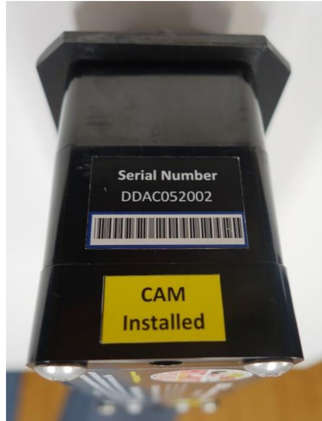
Magnetic Field Generator w/ CAM -External Photo End View with Mounting Arm