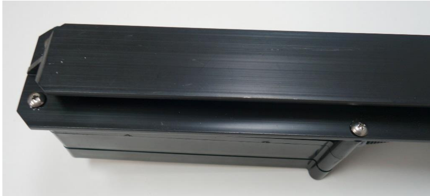
Magnetic Field Generator w/ CAM -External Photo Ferrite Side with Mounting Arm