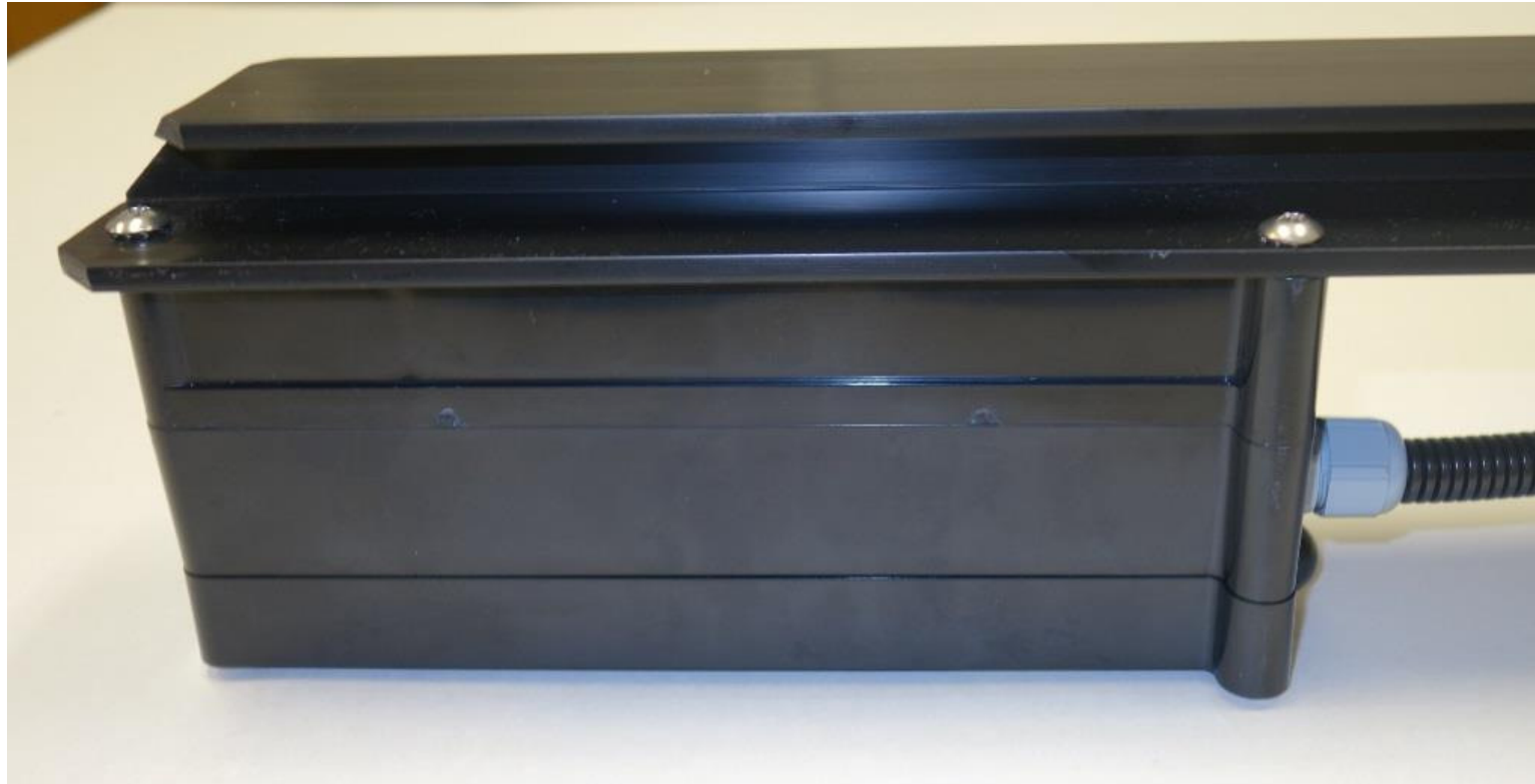
Magnetic Field Generator w/ CAM -External Photo Side View with Mounting Arm