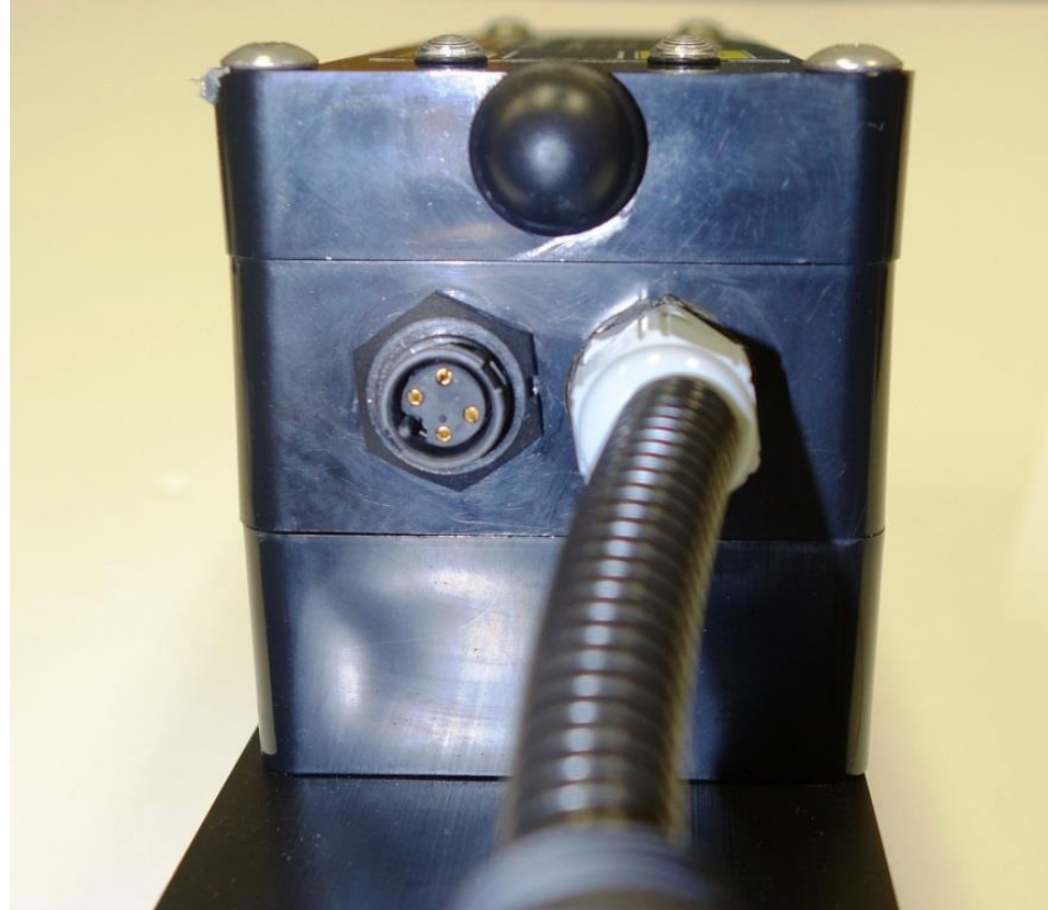
Magnetic Field Generator w/ CAM -External Photo Interface End View with Antenna