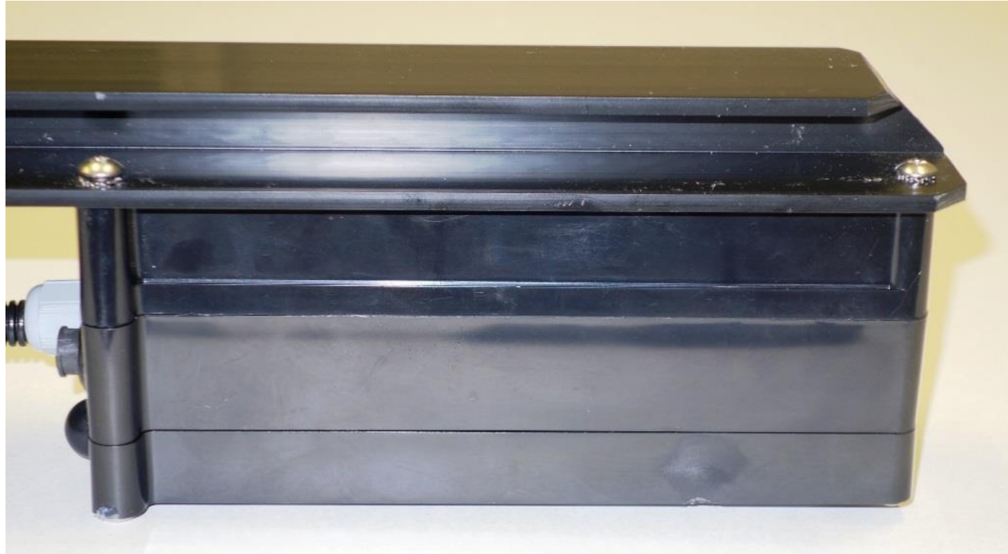
Magnetic Field Generator w/ CAM -External Photo Side View with Mounting Arm