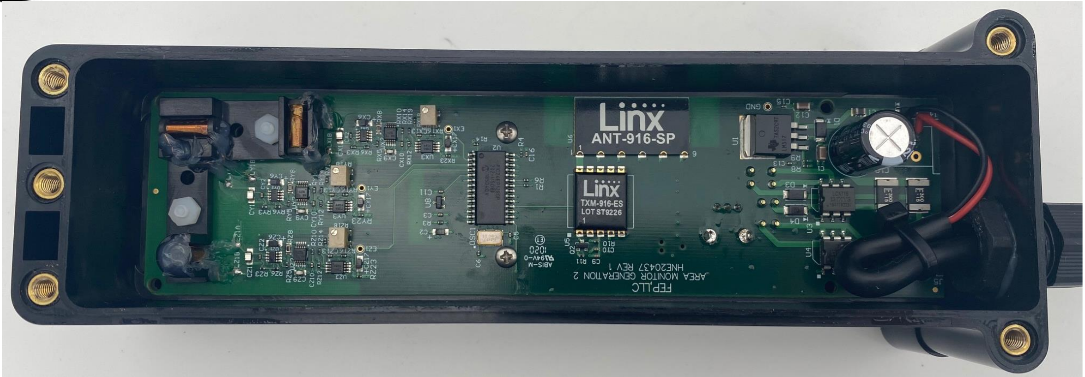
Internal Photo Board-Top View