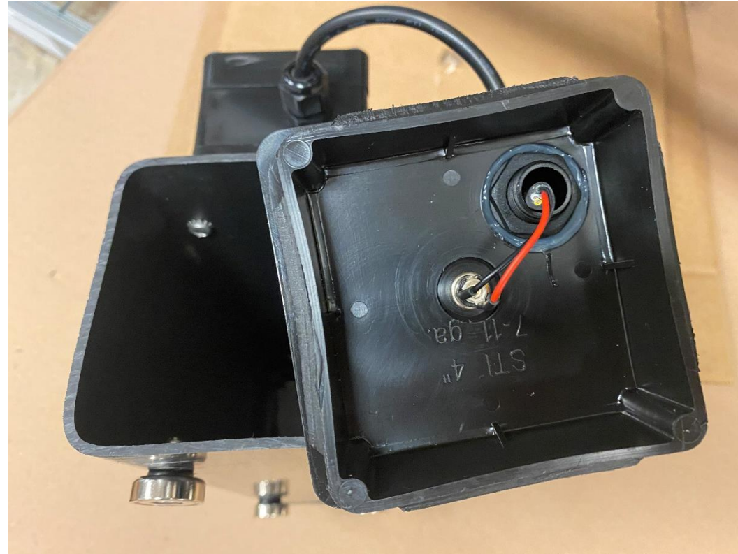
Inside Mounting Base End Cap