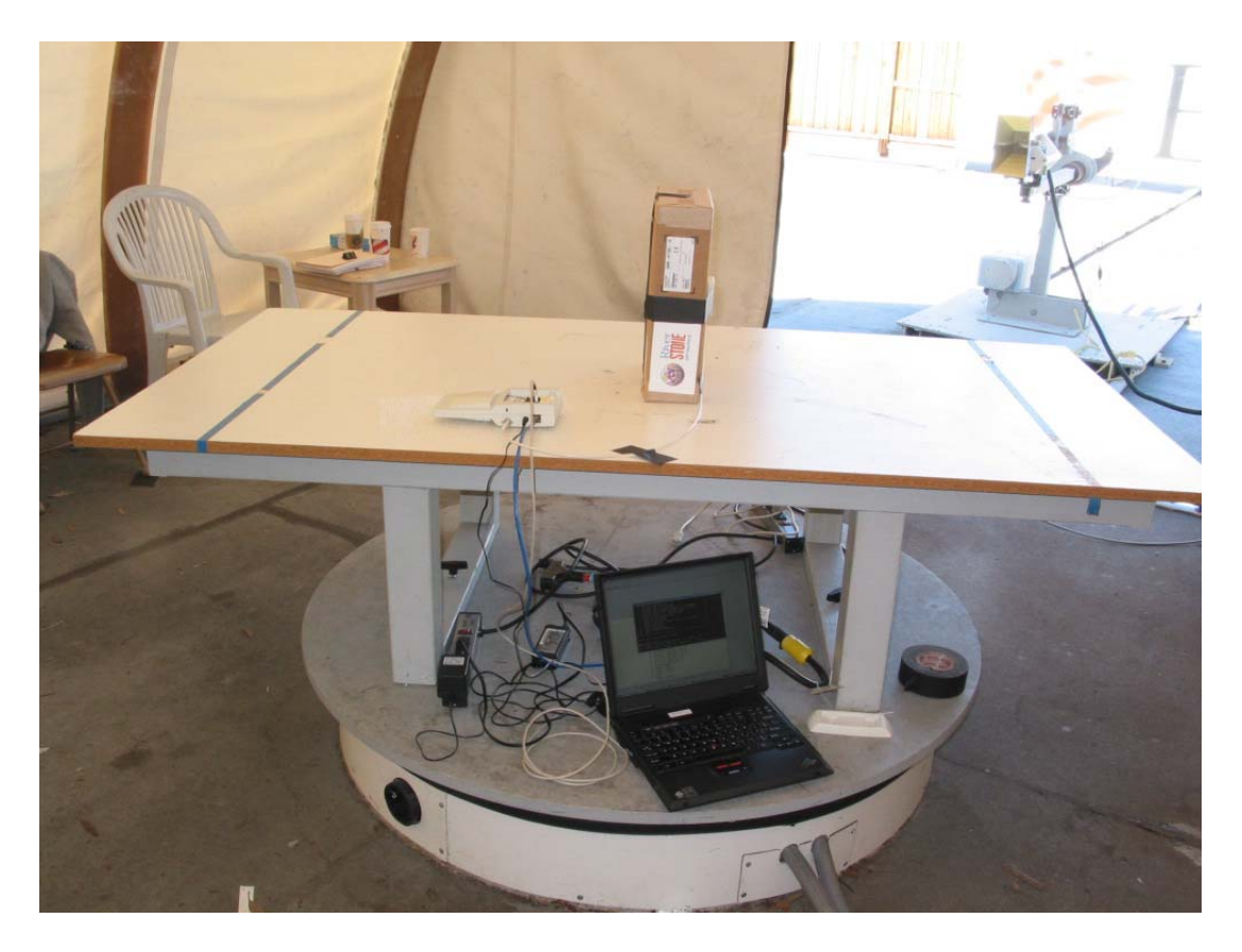
Radiated Emissions in Restricted bands using external antenna