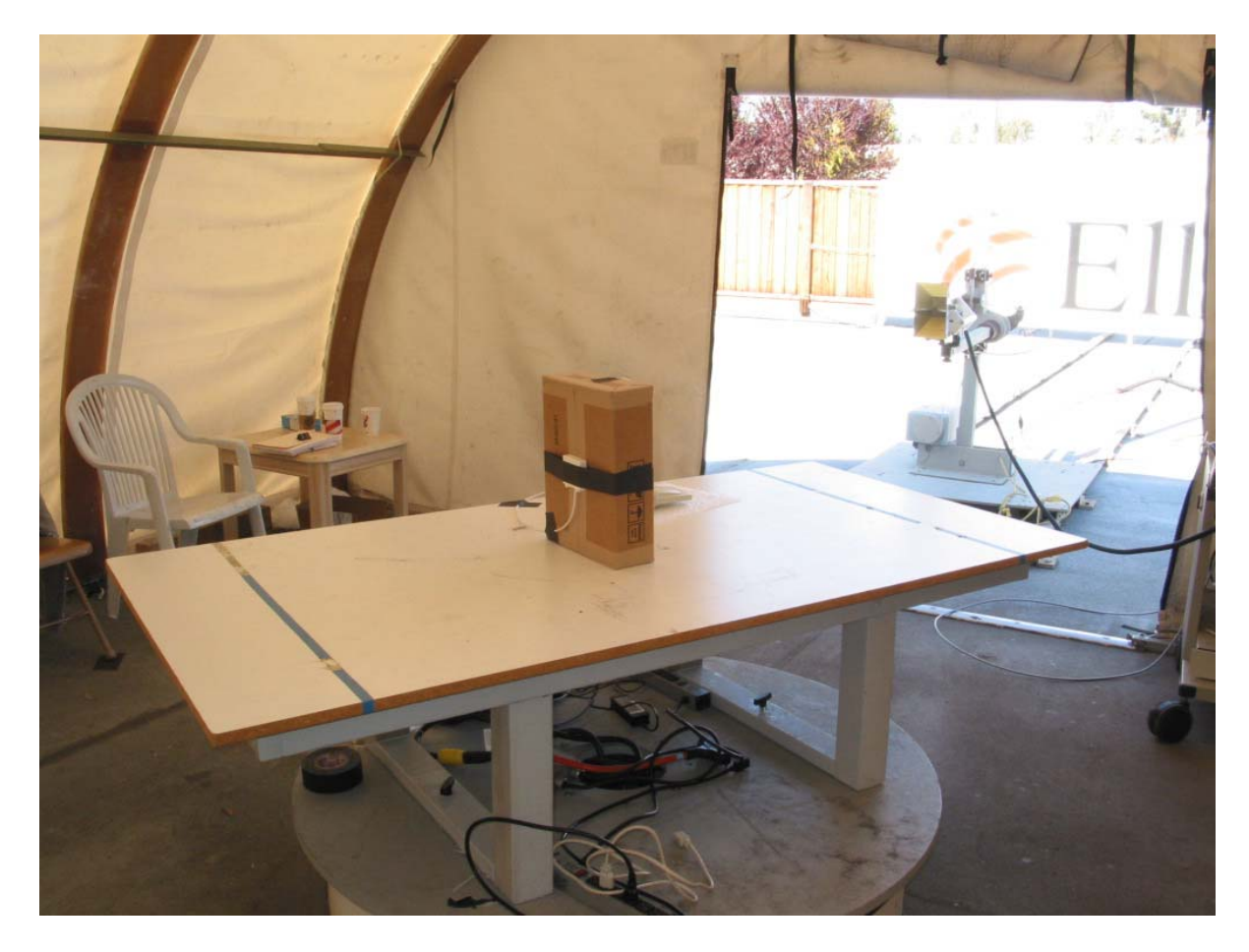
Radiated Emissions in Restricted bands using external antenna