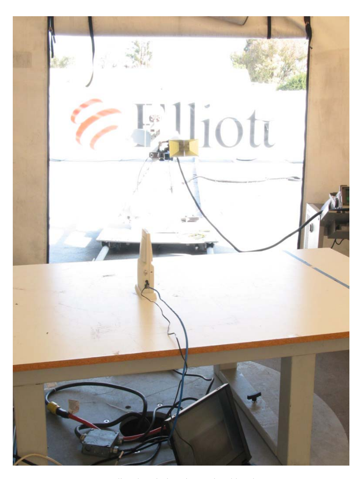
Radiated Emissions in restricted bands