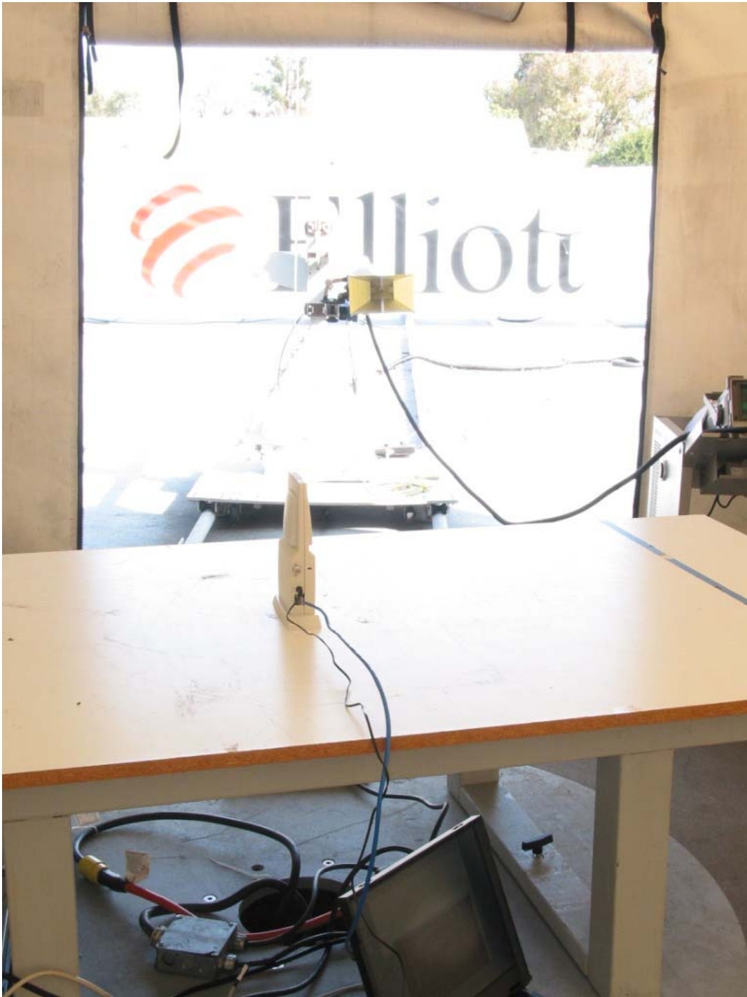
Radiated Emissions in restricted bands