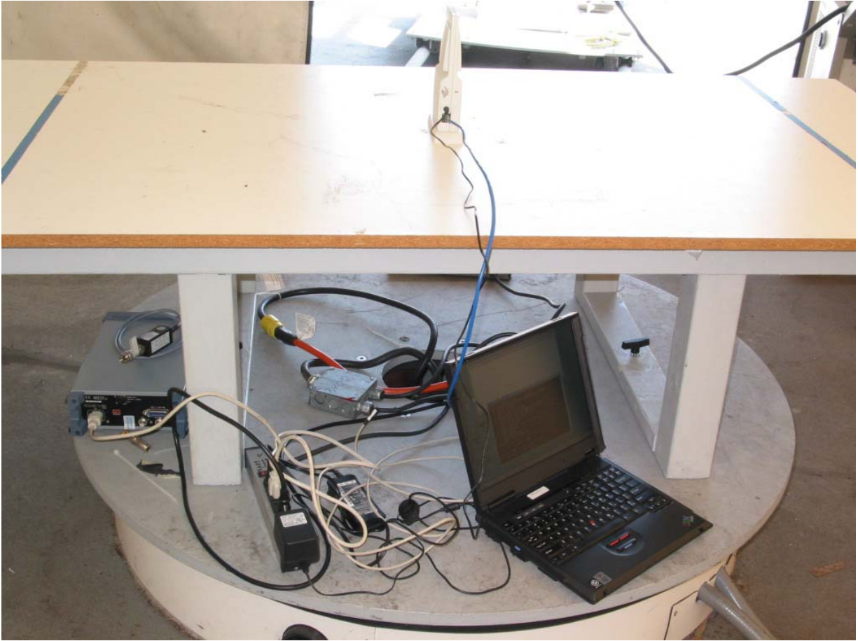
Radiated Emissions in restricted bands