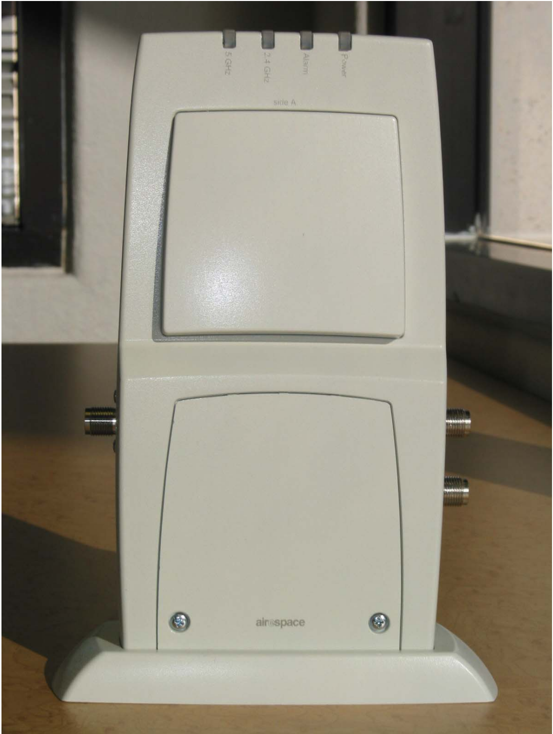
Airespace 1200, Side A