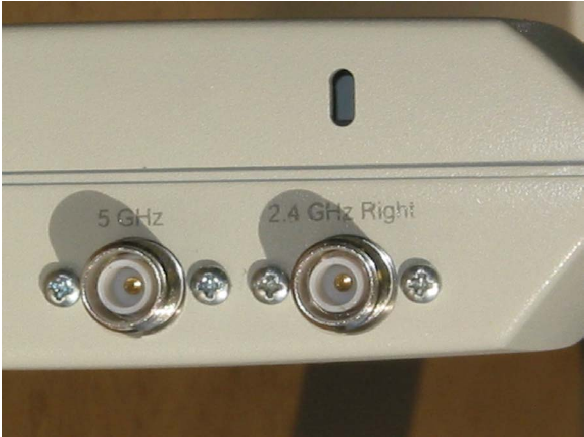
The 5GHz Reverse TNC External connector, (Currently not certified for use and disabled) and one of the reverse TNC external antenna connector for 2.4 GHz