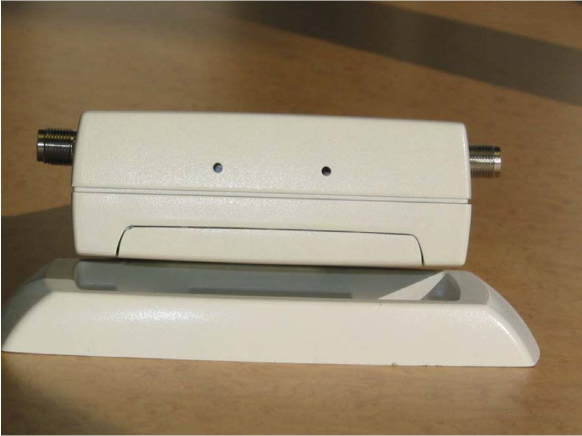
Airespace 1200, Bottom