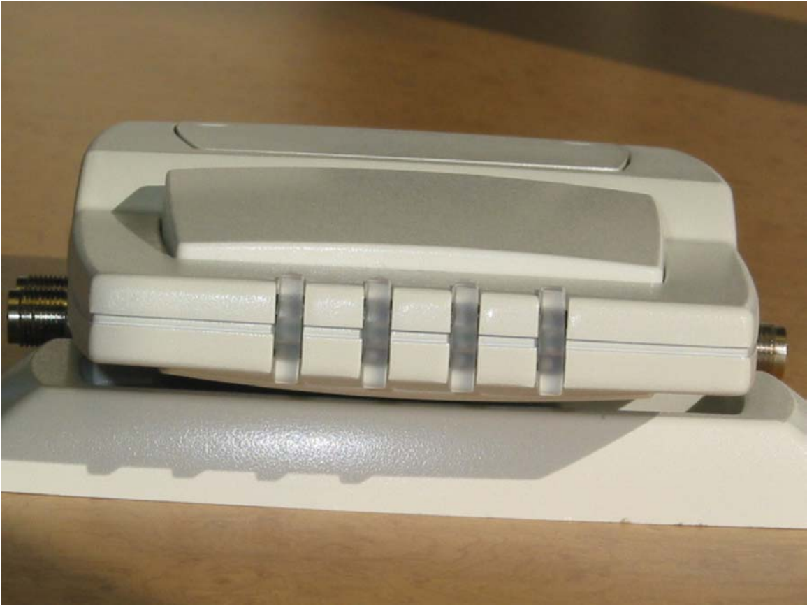
Airespace 1200, Top