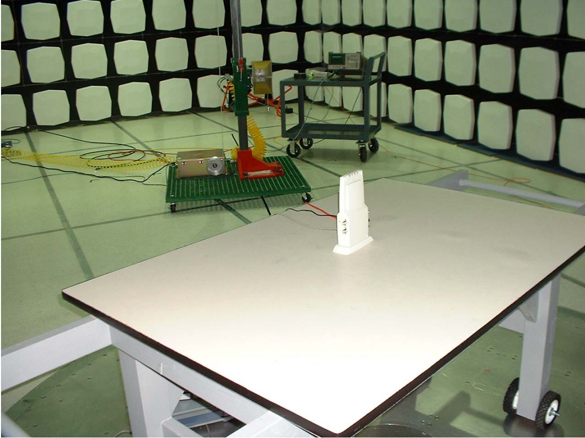
Radiated emissions test setup. Access point radio in the 10 M Chamber @ Elliott Labs in Fremont, CA.