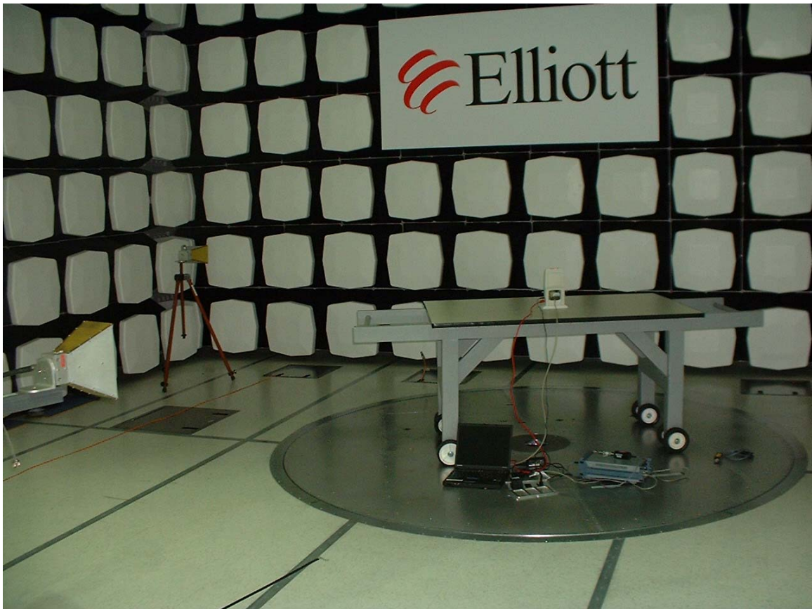
Radiated emissions test setup. Access point radio in the 10 M Chamber @ Elliott Labs in Fremont, CA.