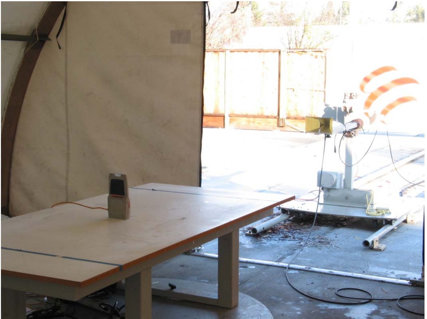
Radiated Emissions in Restricted bands