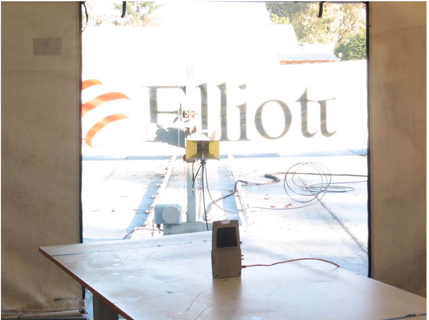
Radiated Emissions in Restricted bands