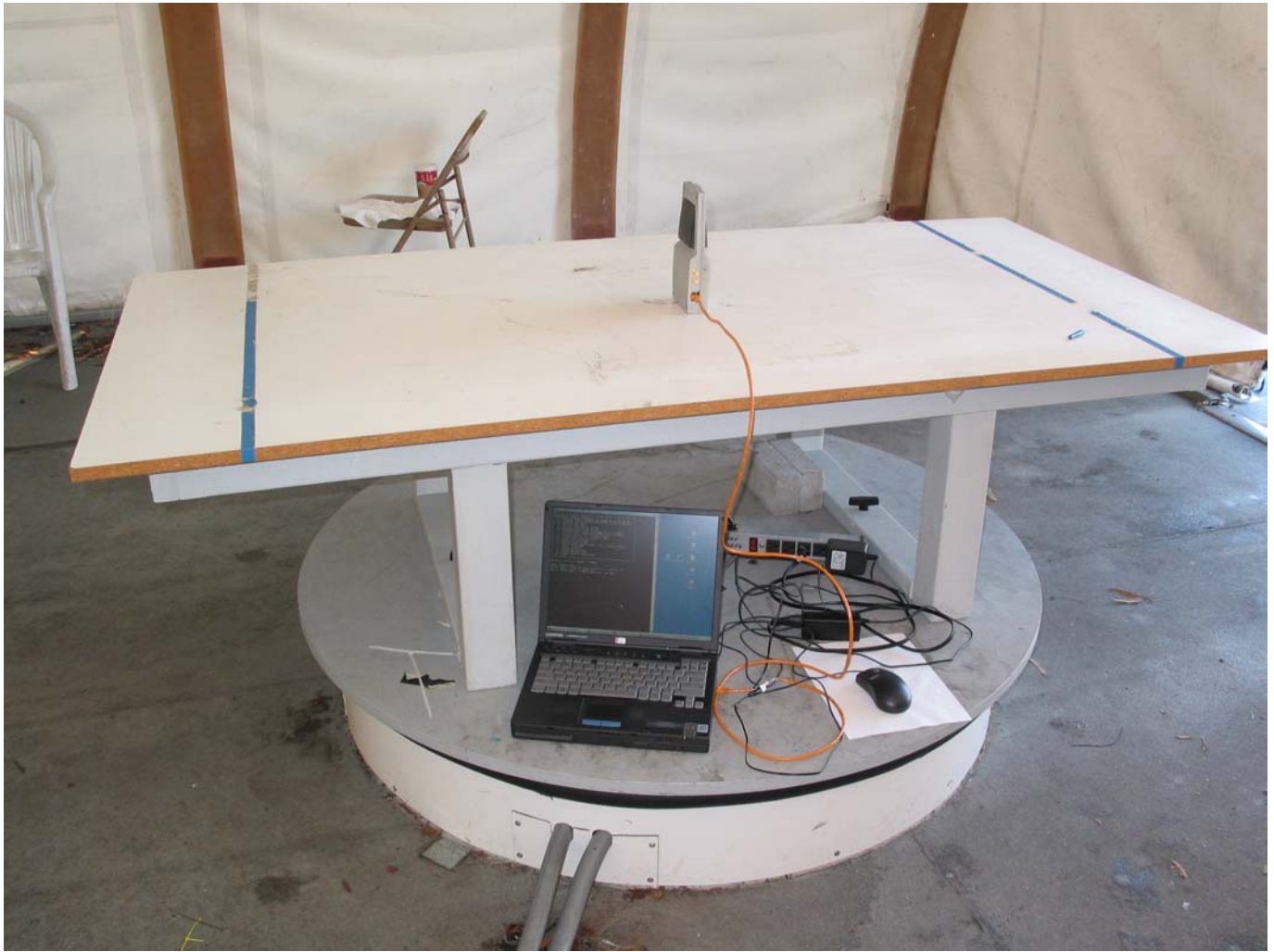
Radiated Emissions in Restricted bands