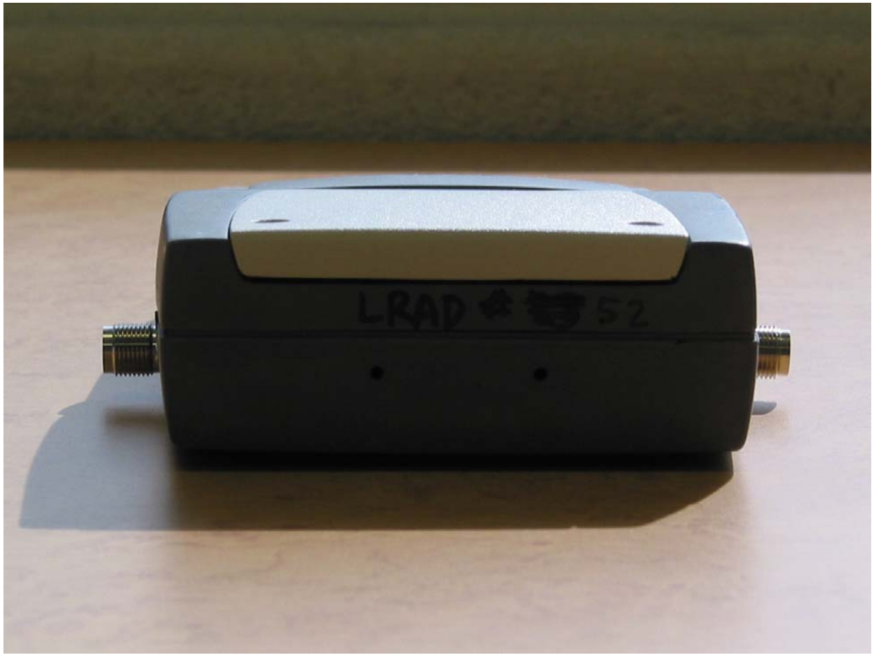
VAP1200B Bottom View