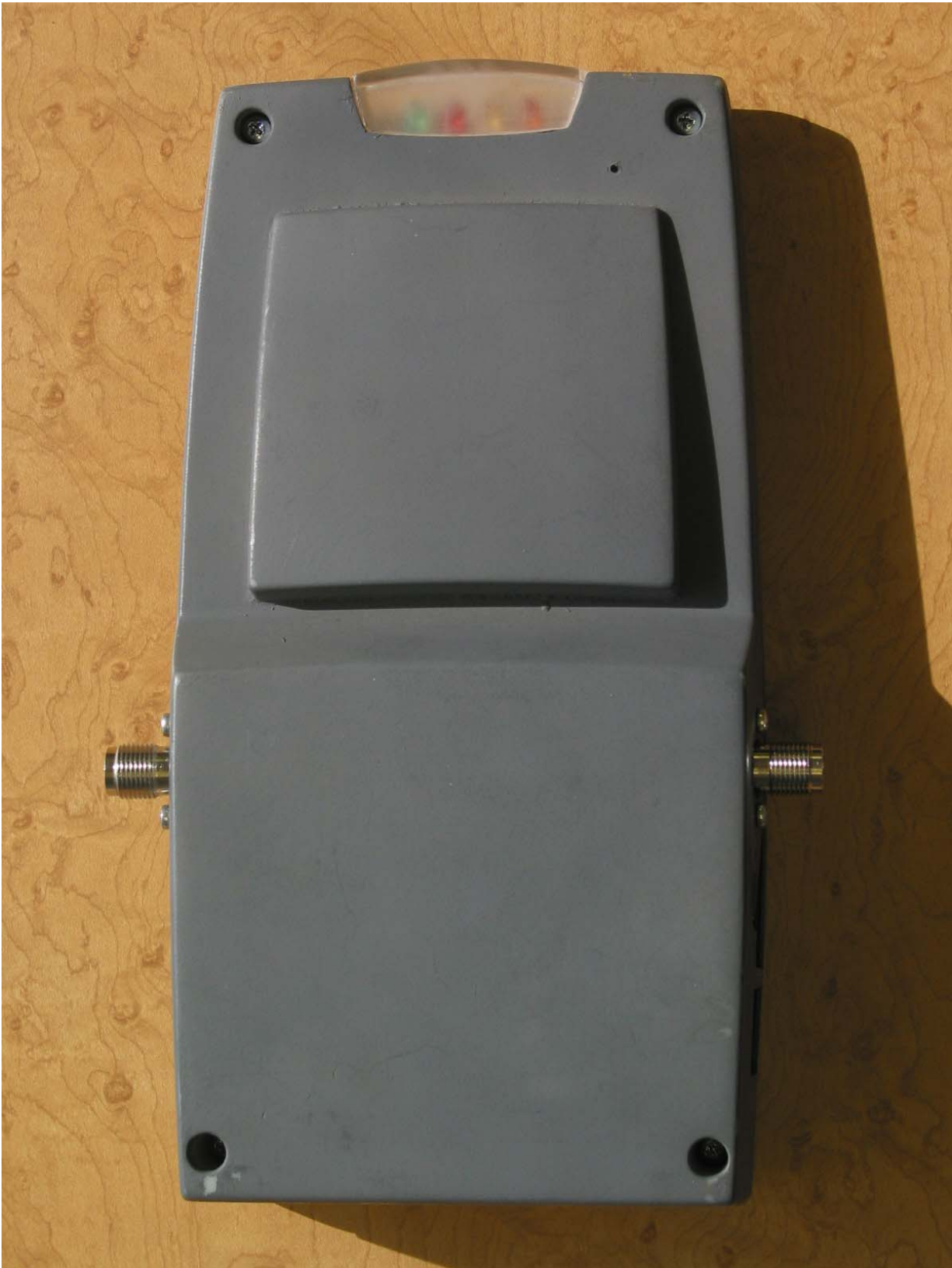
VAP1200 External View, Side 1

External Product Photos, Airespace VAP1200, FCC ID: QTZUSAP1200B 10 Feb 2003