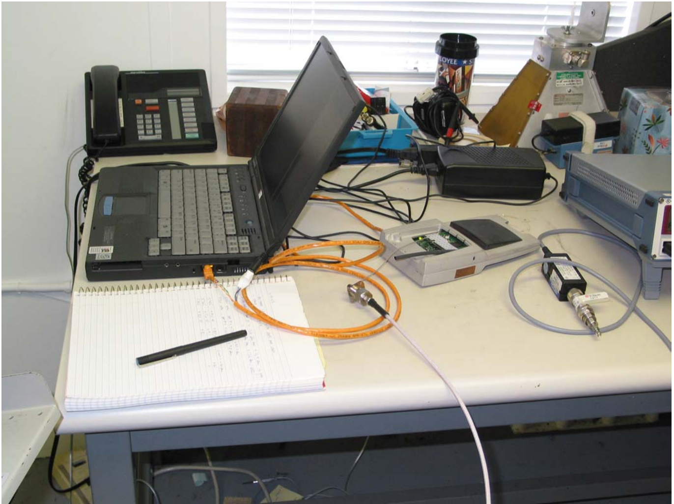
RF Conducted bench Setup