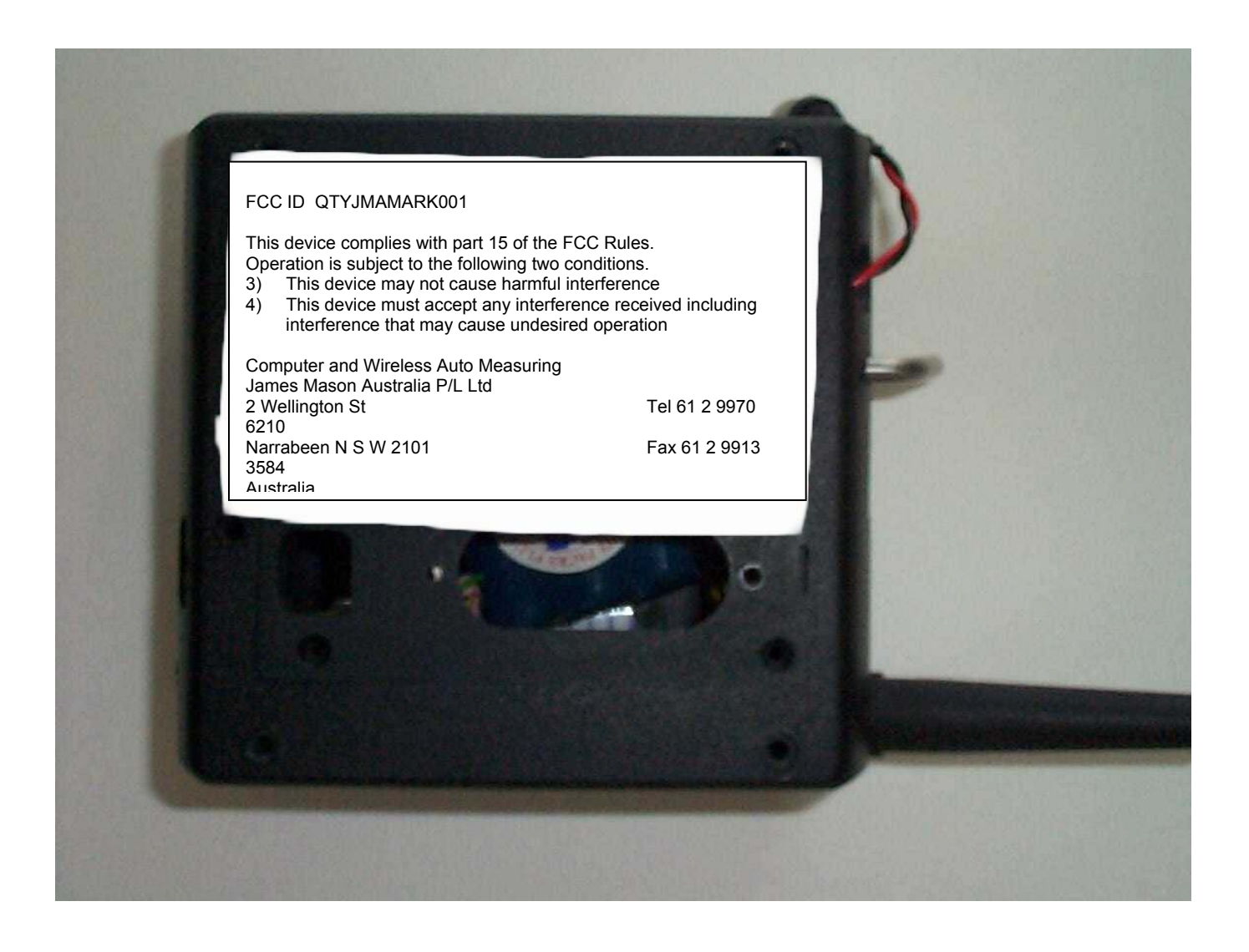
Model: J.M.A. Computer & Wireless Auto Measuring System