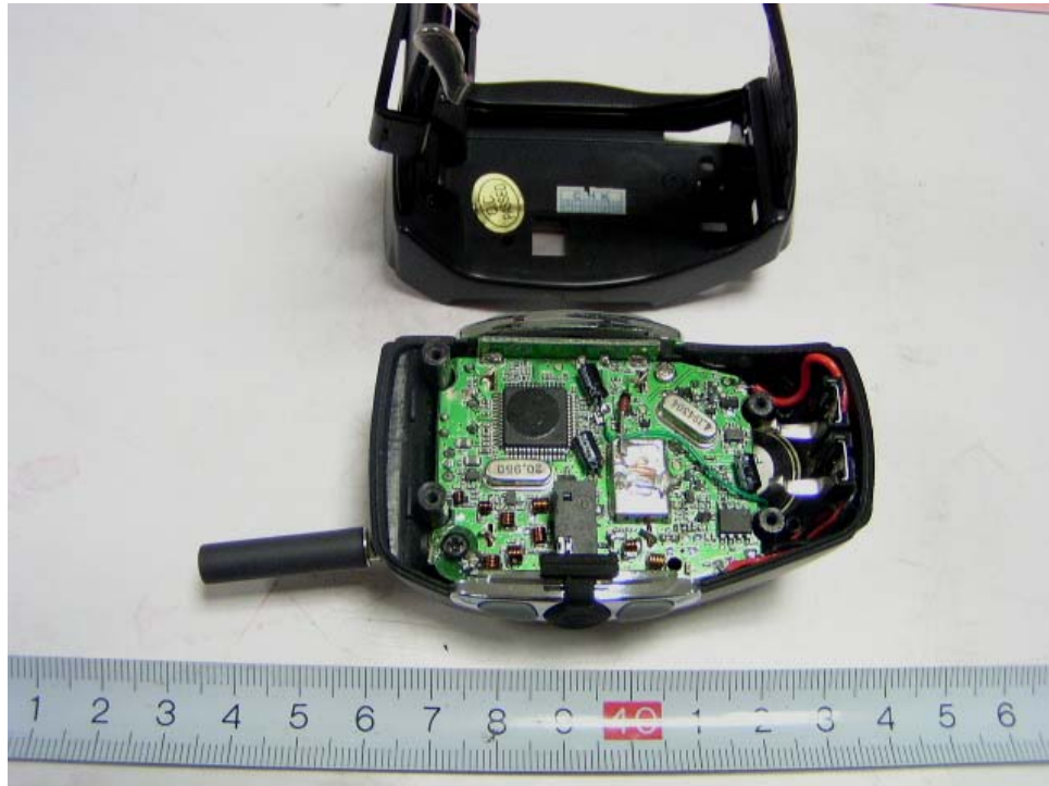
EUT-Inside View (2)