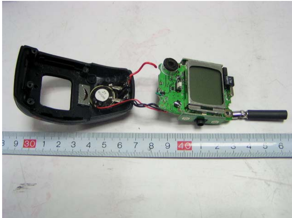
EUT-PCB View (1)