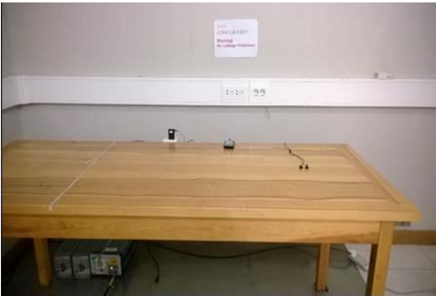
Picture 4. FCC Part 15C AC powerline conducted emissions