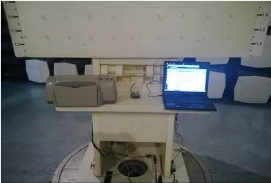
Picture 3. FCC Part 15B Radiated emissions, computer peripherals