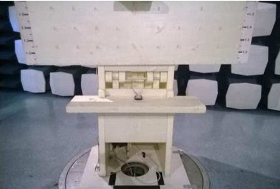
Picture 2. FCC Part 15B Radiated emissions