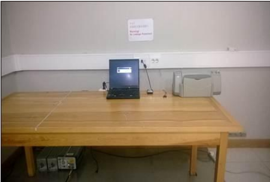
Picture 5. FCC Part 15B AC powerline conducted emissions, computer peripherals, measure from PC charger