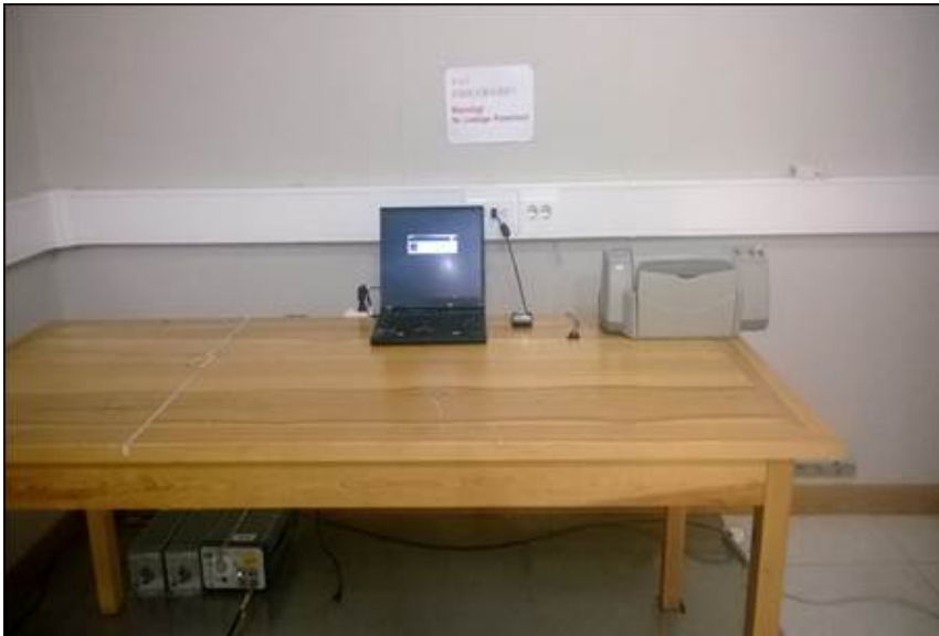
Picture 5. FCC Part 15B AC powerline conducted emissions, computer peripherals, measure from PC charger