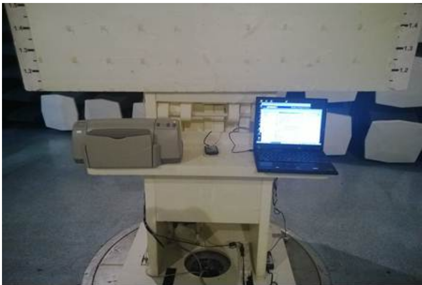
Picture 3. FCC Part 15B Radiated emissions, computer peripherals