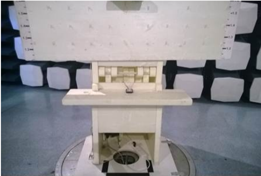
Picture 2. FCC Part 15B Radiated emissions