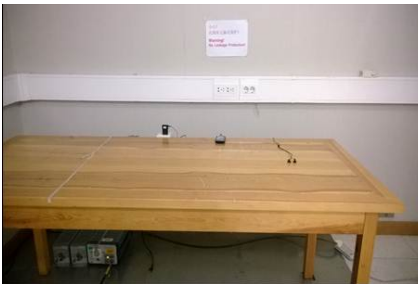
Picture 4. FCC Part 15C AC powerline conducted emissions