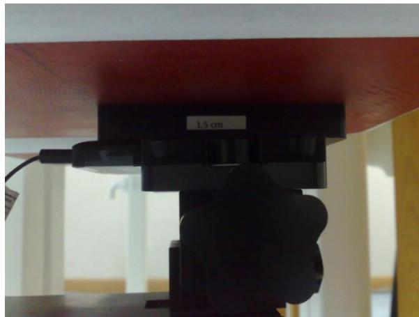
Photo of the device positioned for Body SAR measurement. The spacer was removed for the tests.

The device was placed in the SPEAG holder using the Nokia spacer and placed below the flat section of the phantom. The distance between the device and the phantom was kept at the separation distance indicated in the photo below using a separate flat spacer that was removed before the start of the measurements. The device was oriented with both sides facing the phantom to find the highest results.